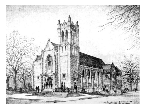
104 Union Street South Concord, North Carolina 28025

Office Phone: 704.786.0166 Website: www.sjnc.net