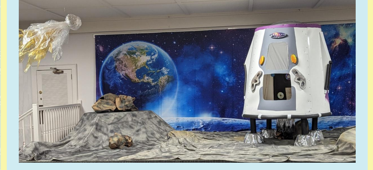
VACATION BIBLE SCHOOL Steller VBS - Shine Jesus' Light