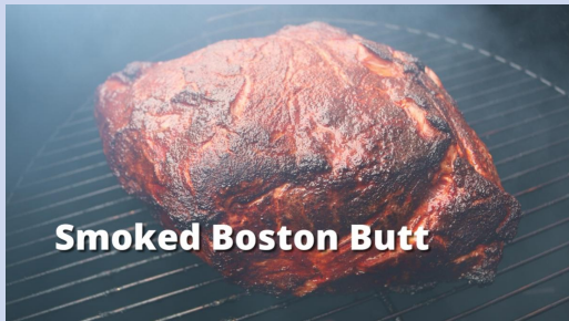
Smoked Boston Butt