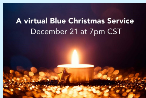
A virtual Blue Christmas Service December 21 at 7pm CST

I told the young Honduran woman about another young woman who was forced to leave home because of a government decree. She, too, was pregnant and made a long and difficult journey. She, too, was far from home and without her mother when the baby came. She had to find shelter wherever she could. This wasn't what she had hoped for when she was growing up. Circumstances beyond her control had forced her into this new existence. That young woman was Mary and the child was Jesus. Precisely in our distress, in our dislocation, the Lord shows up. Emmanuel—God with us—makes his home in the very places we find foreign or isolating. The young Honduran woman, and all of us, can find hope because of the birth of Mary's child. There is no God-forsaken place and we are never alone—not in hospital rooms, or sheltering in place, or Zoom calls or on dangerous roads. Many of us will not be physically home for Christmas, but we are truly home in Christ.