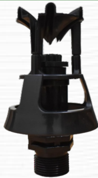
Winkler In 3/4 Inch Size