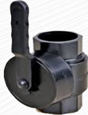
Top Entry Ball Valve In 63mm, 75mm ,90mm Size