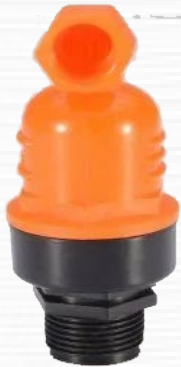
Air Release Valve 1 Inch