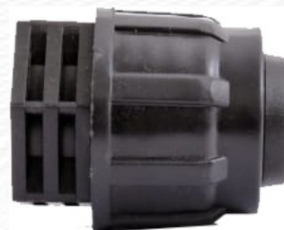
32 mm end cap