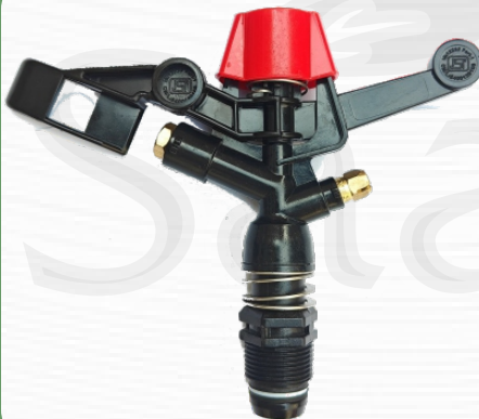
Plastic Sprinkler 3/4 Inch With Brass Jet