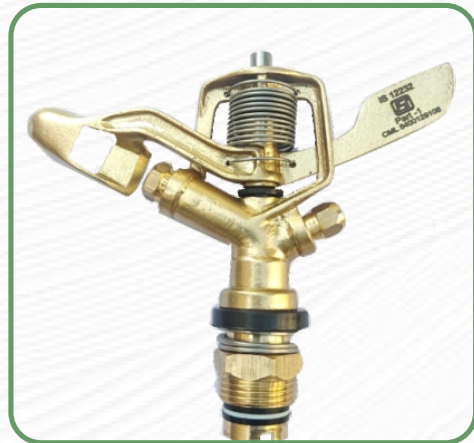
380 grms brass sprinkler