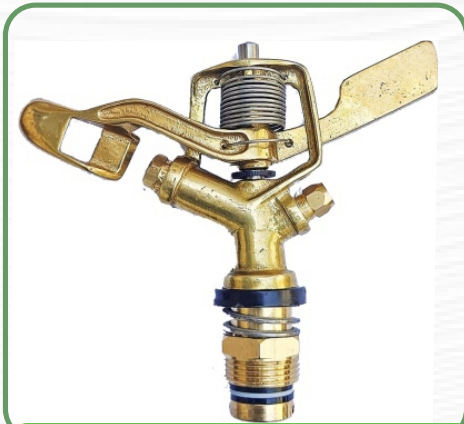
400 grms Brass Sprinkle