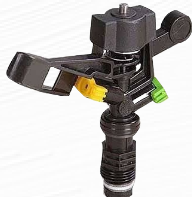
Mini Sprinkler Nozzle (Ss Pin)