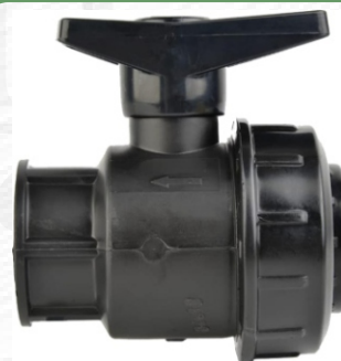
Female x female 32 mm compression valve