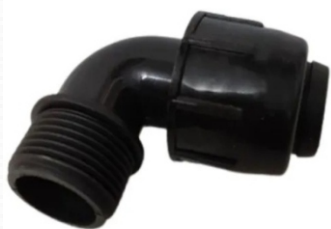
32 MM elbow