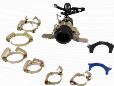
C- clamp and latch clamp in all the sizes with electroplating, powder coating, as well as in hot dip galvanized coating