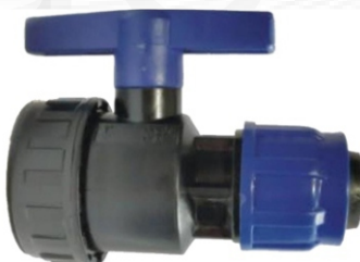
Female compression valve