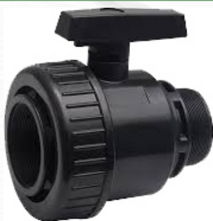
Male x female 32 mm valve