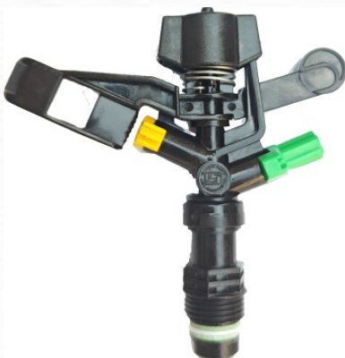
Mini Sprinkler Nozzle (High Quality)