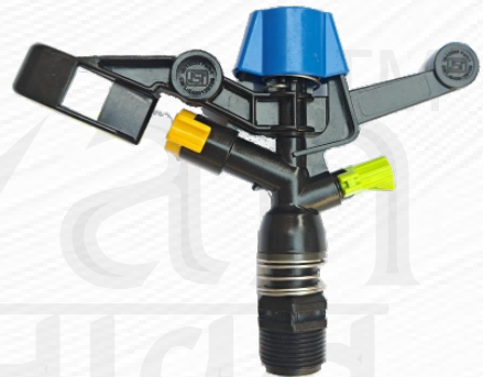
Plastic Sprinkler 3/4 Inch