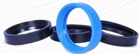
Sprinkler rubber rings 20mm to 400 mm