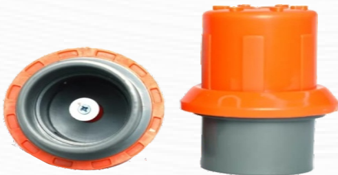
Flush Valve In 63mm As Well As 75mm Size