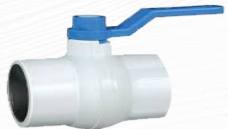
Solid Ball Valve In 63mm:75 mm;90mmSize With Heavy M.s Long Handle