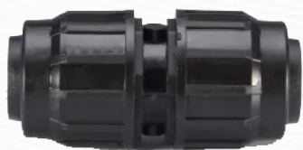
32 MM joiner