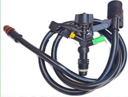
Mini Sprinkler Nozzle Tube