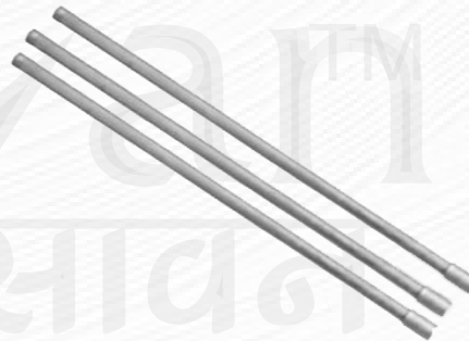
Sprinkler Riser Piper In All Weight And Sizes