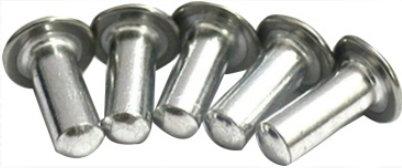
Sprinkler Aluminium Rivet