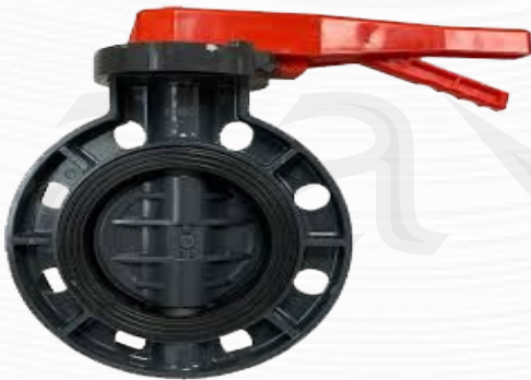
Butterfly Valve 63mm, 75mm, 90mm Size