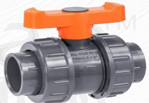
Double Union Ball Valve In 63mm 75mm A Well 90mm Size