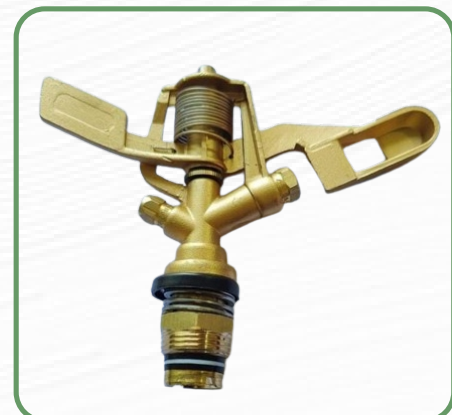
Zinc sprinkler 3/4 inch ( light weight)