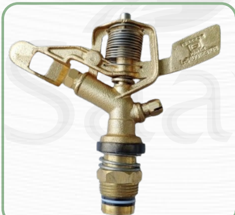
350 grms Brass Sprinkle