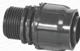
32 MM MTA