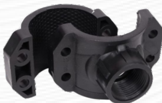
Service saddle available in 50mm 63 mm 75 mm 90 mm size