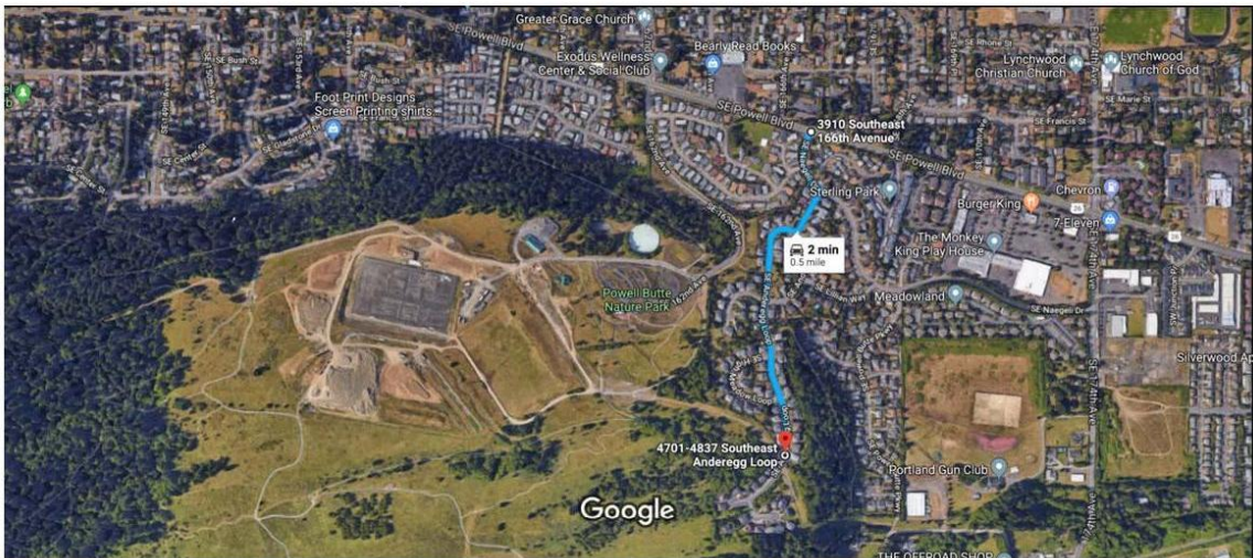
Imagery ©2019 Google, Map data ©2019 Google 500 ft

Google Maps 3910 SE 166th Ave, Portland, OR 97236 to 4701-4837 SE Anderegg Loop Drive 0.5 mile, 2 min Loop Powell Butte Nature Park - Conduit Lane Entrance