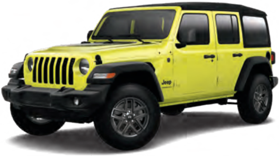
Wrangler 4DR Sport S in High Velocity