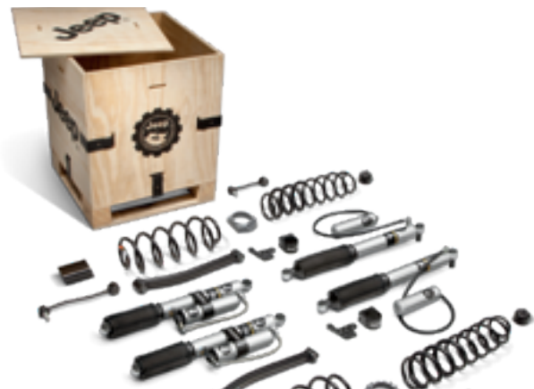
2-inch Lift Kit with Bilstein ® Shocks 17,18

JEEP ® WRANGLER RUBICON ® IN HYDRO BLUE FEATURES TUBE DOOR KIT, TUBE DOOR MIRROR KIT, JEEP PERFORMANCE PARTS ROCK RAILS, 17-INCH BEADLOCK-CAPABLE WHEELS WITH FUNCTIONAL BEADLOCK RINGS, GRILLE AND WINCH GUARD HOOP, FRONT GRAB HANDLES, 5- AND 7-INCH LED OFF-ROAD LIGHT KITS, WINCH GUARD LIGHT MOUNTING BRACKETS AND LOWER A-PILLAR LIGHT MOUNTING BRACKETS