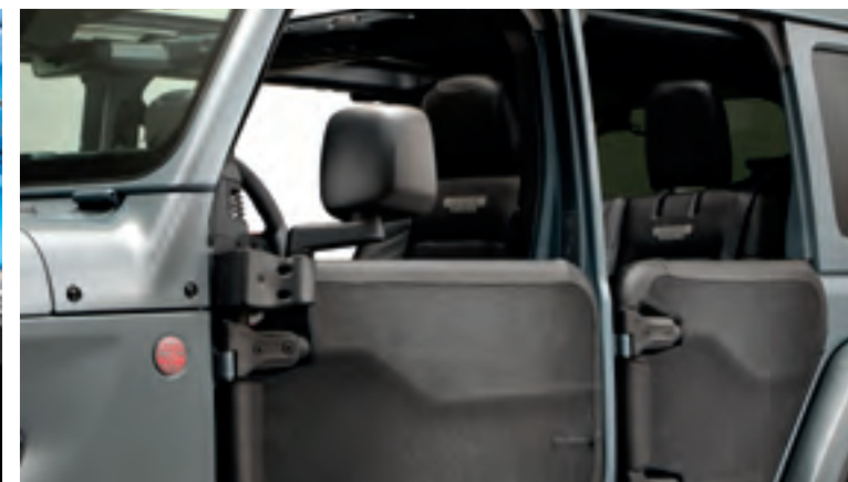
Tube Door Mesh Covers and Tube Door Mirror Kit 19