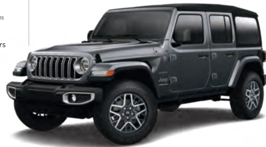
Wrangler 4DR Sahara® in Granite Crystal Metallic