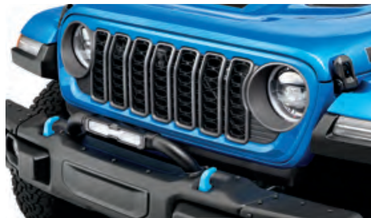
Grille Guard with Integrated Light Bar 19