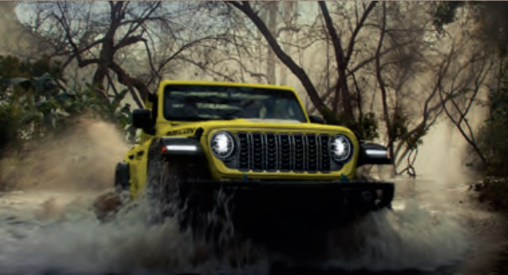
*Colors may not be available on all models and may be limited / restricted.