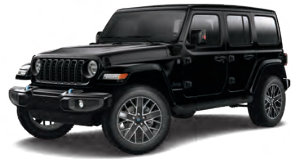
Wrangler 4DR High Altitude 4xe in Black