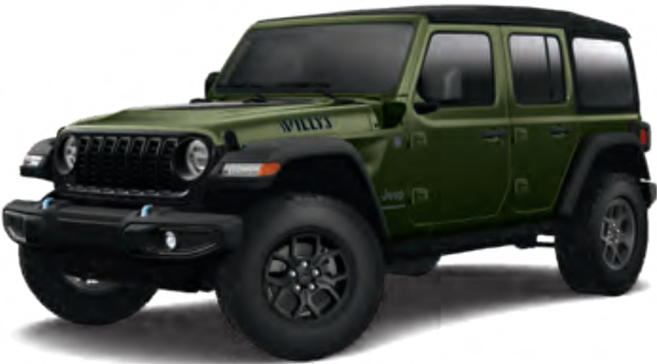
Wrangler Willys 4xe in Sarge