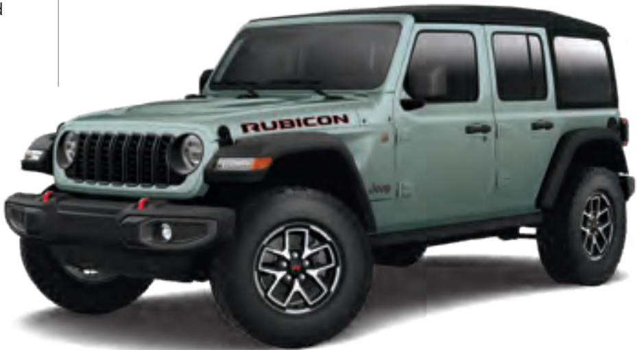
Wrangler 4DR Rubicon® in Earl