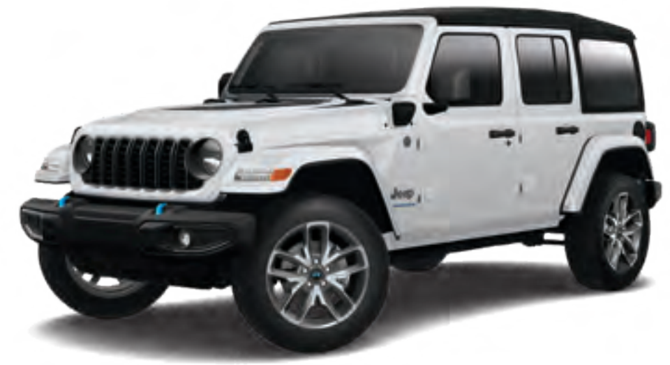
Wrangler 4DR Sport S 4xe in Bright White