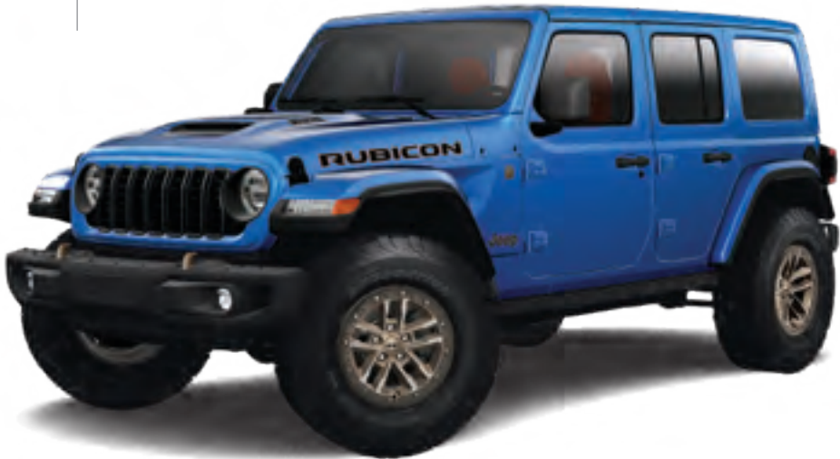
Wrangler 4DR Rubicon® 392 in Hydro Blue