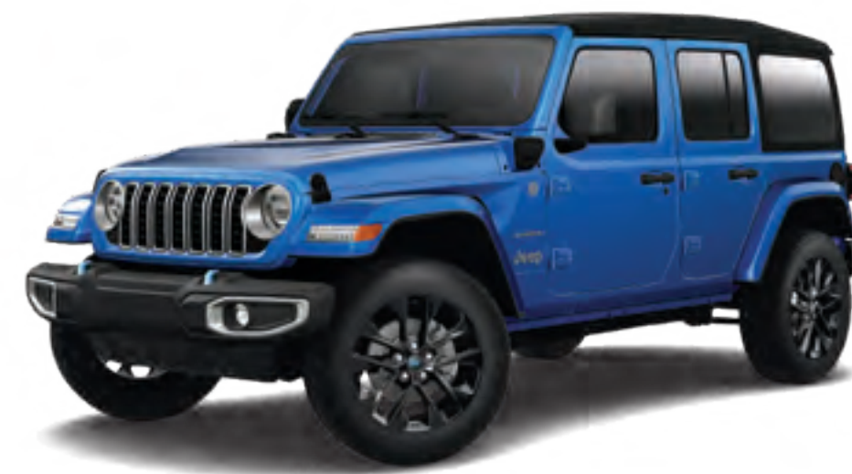
Wrangler 4DR Sahara® 4xe in Hydro Blue