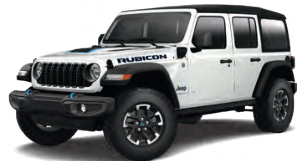
Wrangler 4DR Rubicon® 4xe in Bright White