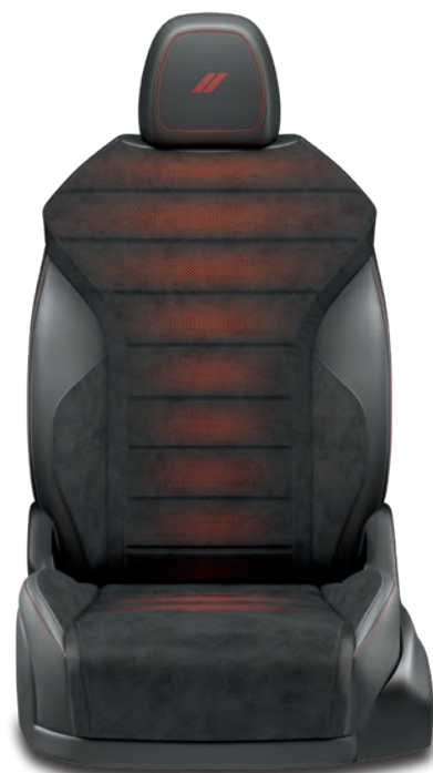
Perforated Alcantara® with Red Backing and Black Scuba Shark Bolsters with Red Accent Stitching (Included with Track Pack in Black)