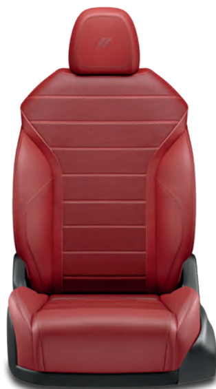
Perforated Leather Trim with Embroidered Dodge Logo and Red Stitching (Available in Red)