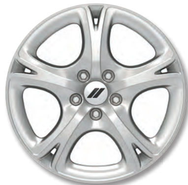
17-inch Silver // [WEF] Standard