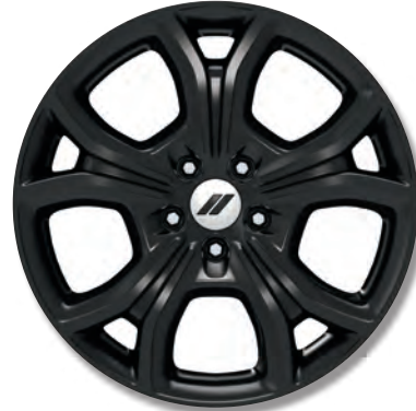
18-inch Abyss Finish // [WHG] Included with Blacktop Package