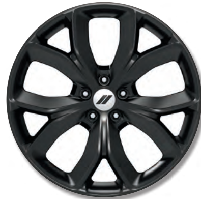
20-inch Abyss Finish // [WHN] Included with Track Pack