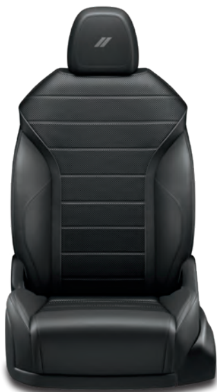
Perforated Leather Trim with Embroidered Dodge Logo and Black Stitching (Standard in Black)