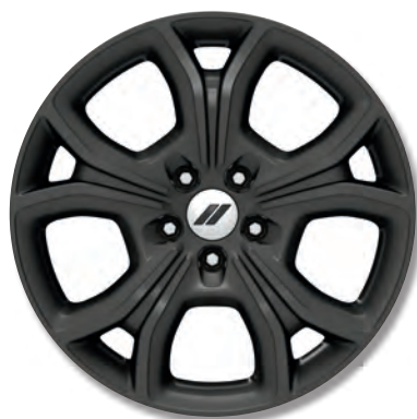
18-inch Graphite Gray // (WLF) Standard