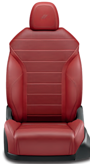
Perforated Leather Trim with Embroidered Dodge Logo and Red Stitching [Available in Red]