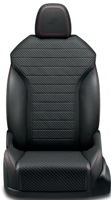
Cloth/Leatherette with Red Accent Stitching (Standard in Black)