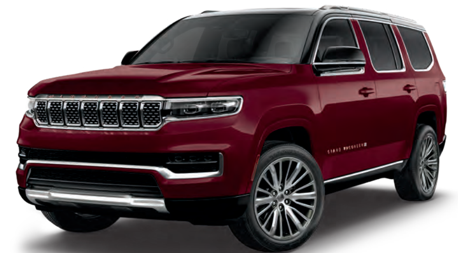
Grand Wagoneer Series III in Velvet Red Pearl