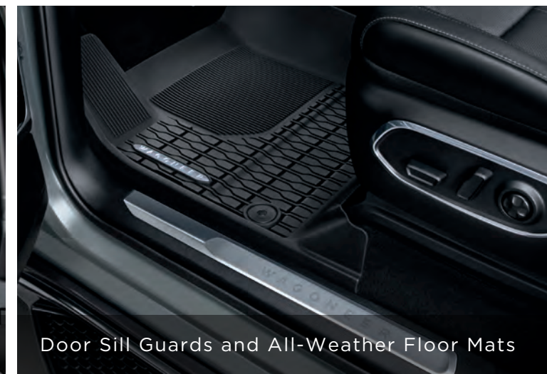
Door Sill Guards and All-Weather Floor Mats