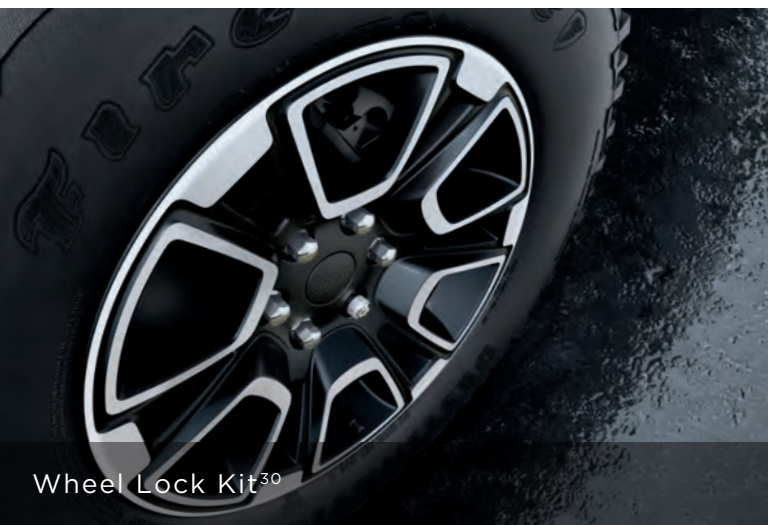
Wheel Lock Kit 30