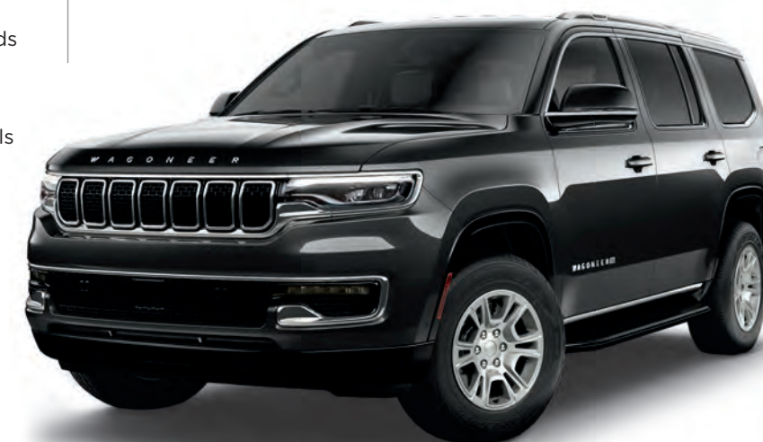
Wagoneer in Baltic Gray Metallic