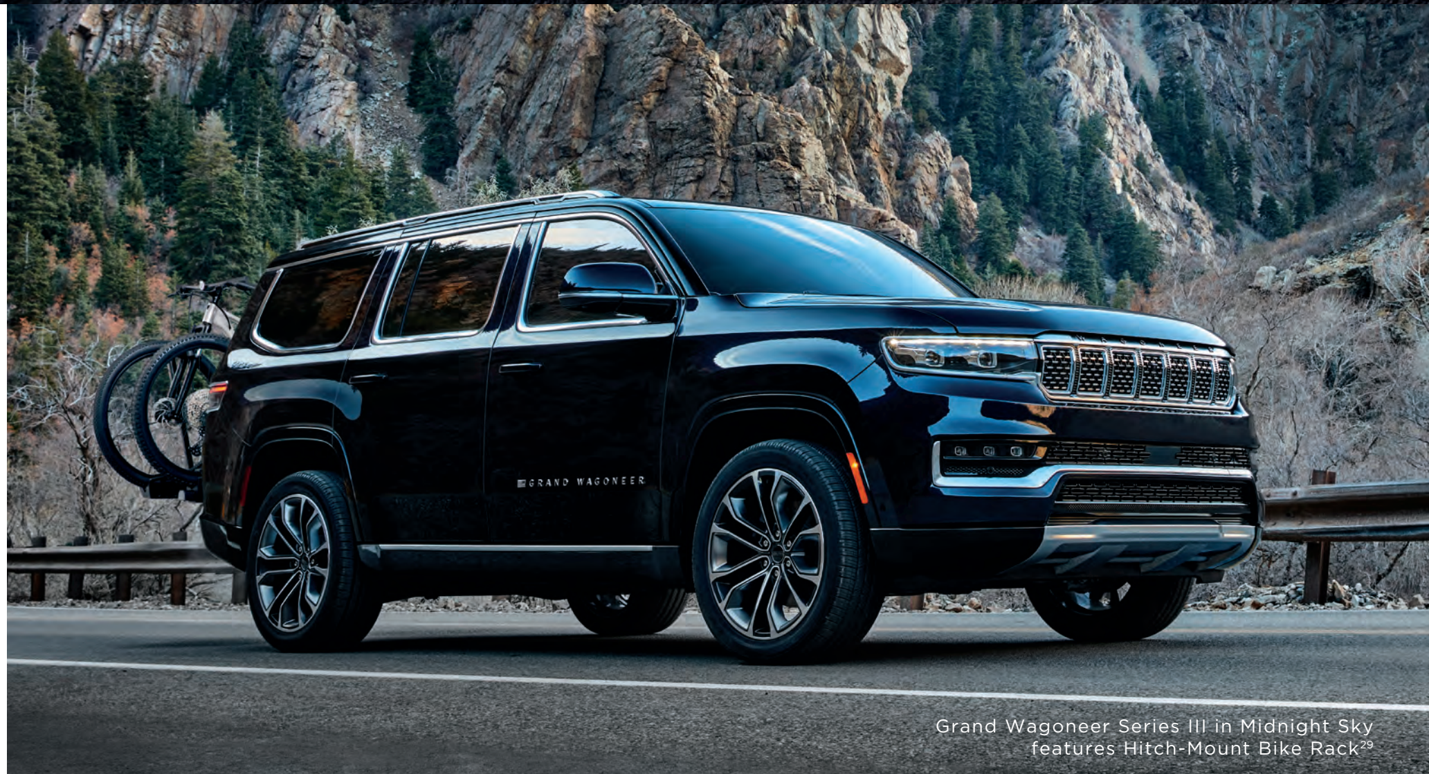
Grand Wagoneer Series III in Midnight Sky features Hitch-Mount Bike Rack 29

To learn more about the full line of Authentic Accessories available for your Wagoneer, visit mopar.com