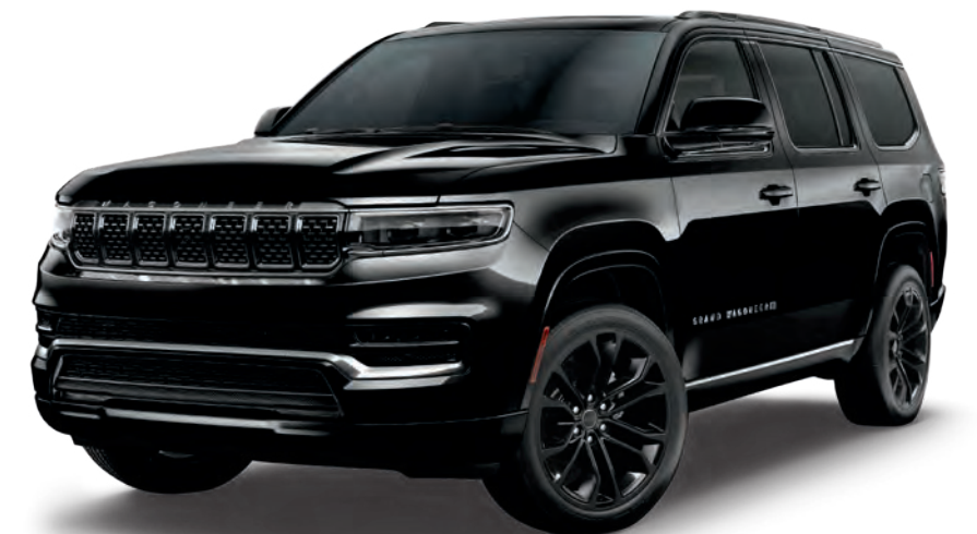
Obsidian in Diamond Black Crystal Pearl