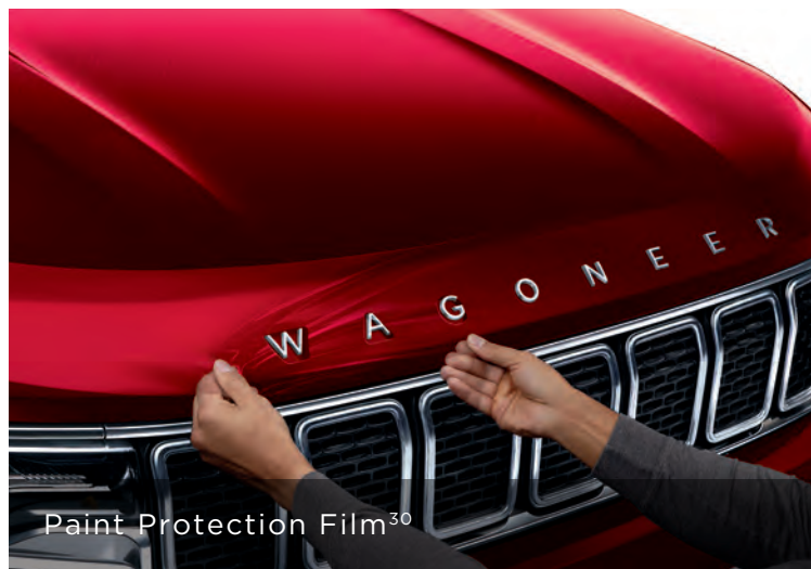
Paint Protection Film 30