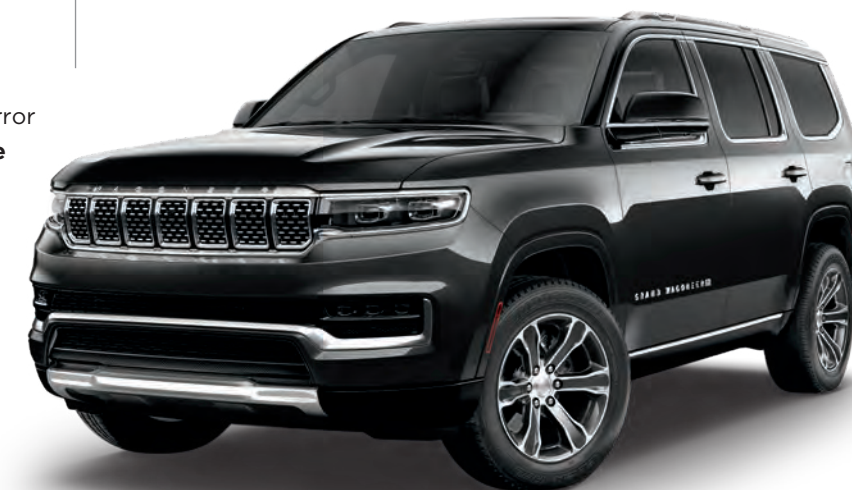
Grand Wagoneer in Baltic Gray Metallic