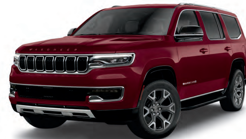
Wagoneer Series III in Velvet Red Pearl