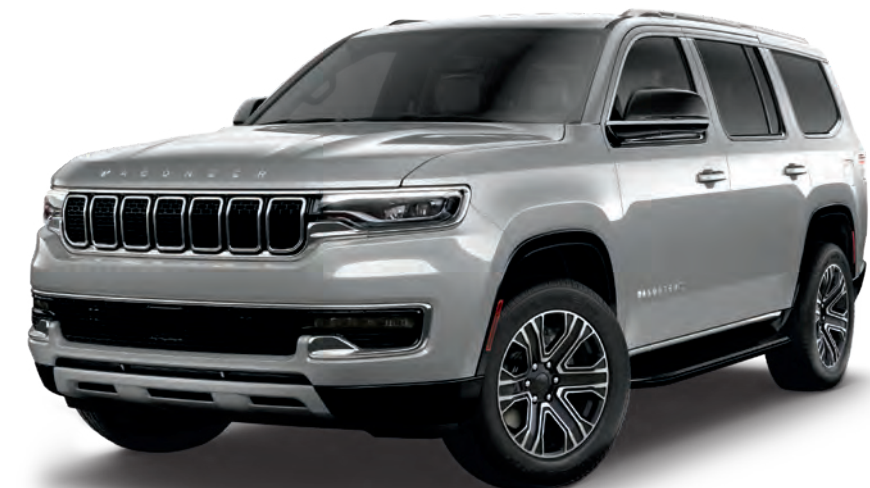
Wagoneer Series II in Silver Zynith