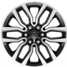
20-inch Premium Painted/Polished Aluminum Standard (WRM)