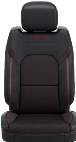
Leather-Trimmed Bucket— Black with Red Accents Included with Rebel X