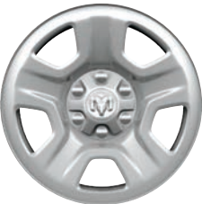
18-inch Steel Painted Standard (WBF)