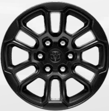
18-inch Mid-Gloss Black-Painted Aluminum Standard (WBL)