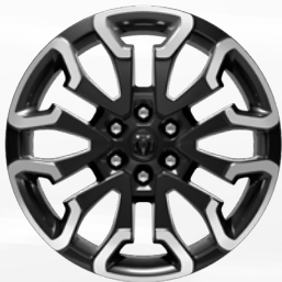
22-inch Black-Painted/Polished Aluminum Optional (WPG)