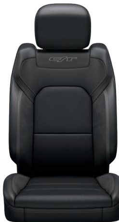
Leather-Trimmed Bucket— Black Included with G/T Package