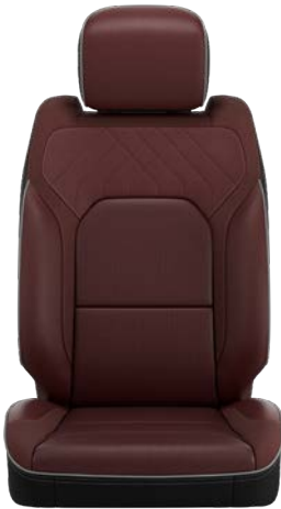
Premium Leather Quilted Bucket— Ebony Red/Black Optional