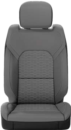
Cloth Bucket— Diesel Gray/Black Optional