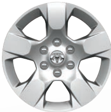
18-inch Painted Aluminum Included with Chrome Appearance Group (WBB)