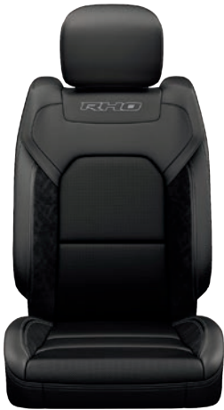
Premium Leather Bucket with Suede— Black with Gray accents Standard

Bilstein® Black Hawk® e2 adaptive shocks Class IV trailer hitch receiver 13-inch travel front suspension 14-inch travel rear suspension 6-inch increased front and rear track 33-gallon fuel tank Skid plate underbody protection Launch control Performance Drive Modes Dana 60™ rear axle with electronic locking differential Full-time BorgWarner transfer case with 4WD Auto, 4WD High and 4WD Low Uconnect Performance Pages and Off-Road Information Pages High-performance air induction system 3.92 axle ratio Electronic locking rear axle Front and rear exterior lighting animation LED pickup box lighting Remote tailgate release Selec-Speed® control Trailer Brake Controller