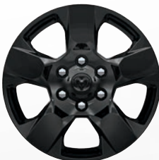
18-inch Black-Painted Aluminum Included with Night Edition (WBP)