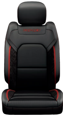
Premium Leather Bucket with Suede— Black with Red accents Optional