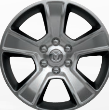
20-inch Polished/Painted Aluminum Included with Sport Appearance Package; Optional with Chrome Appearance Group (WRF)