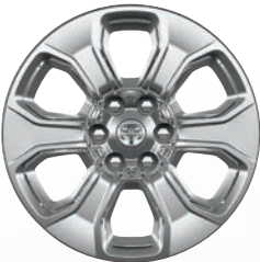
20-inch Chrome-Clad Aluminum Standard (WRD)