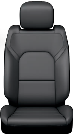
Vinyl Bench— Diesel Gray/Black Standard

6 air bags 3 including driver and front-passenger, side-curtain and front-seat side-mounted Electronic Stability Control (ESC) 4 Antilock 4-wheel disc brakes Sentry Key® Theft Deterrent System Remote Keyless Entry Tire Pressure Monitoring System with display Tire-Fill Alert System ParkView® Rear Back-Up Camera 5 Electronic parking brake Rear-Seat Reminder Alert Tailgate-ajar warning lamp Active Lane Management System Adaptive Cruise Control with Stop & Go 6 Auto High-Beam Headlamp Control Blind Spot Monitoring (BSM) 7 with Rear Cross Path and Trailer Detection 5 Full-Speed Forward Collision Warning Plus (FSFCCW+) 8 ParkSense® Front/Rear Park Assist with Stop 9 Pedestrian Emergency Braking 8