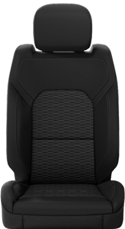
Cloth Bench— Black Optional