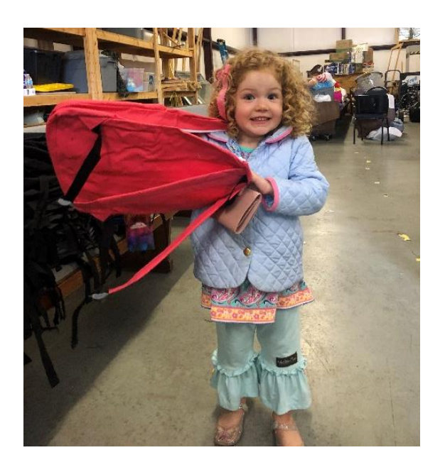
Ukraine Missions A Ministry of the Hardin Valley Church of Christ 11515 Hardin Valley Road Knoxville, TN 37932