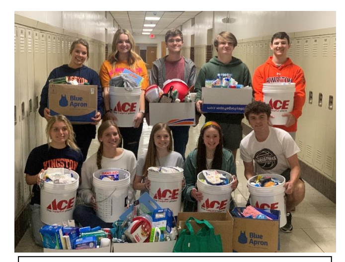
Students from Kingston High School, Roane County

On Wednesday 16 March, the first cargo relief container of "Family Buckets," 372 buckets from East Tennessee, left Columbia TN to a port in Savannah, GA headed to the town of Zalischyky, Poland. The city is located about 180 miles from the Ukrainian Polish Border. This town of about 9000 has received about 4000 refugees. However, the town is only able to provide relief for about 1000 people. So, help was requested, and this is where the first container is going.