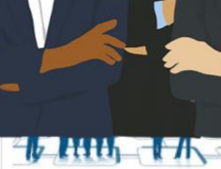
Interviewing Skills Training for Interviewers