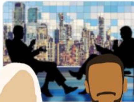
Business Etiquette and Personal Grooming