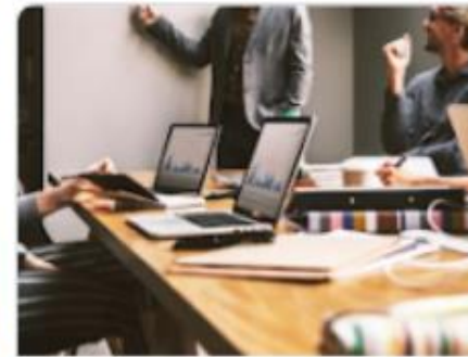
Teamwork & Collaboration