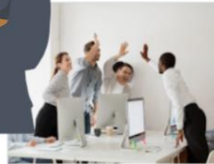
Interviewing Skills Training for Interviewers