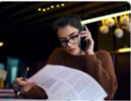
Workplace Conflict/Stress Management

-Step into your enormity and truly live the magnificent life-