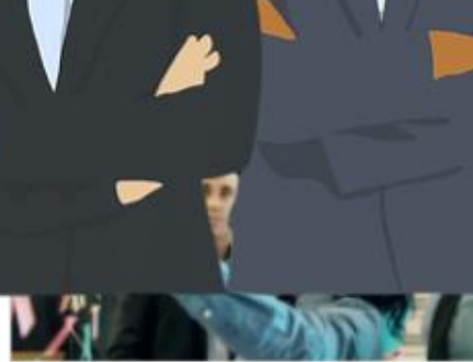
Interviewing Skills Training for Interviewers