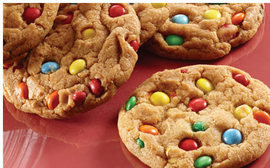
702 Rainbow $24.00 2.5 lb. box with 40 pucks