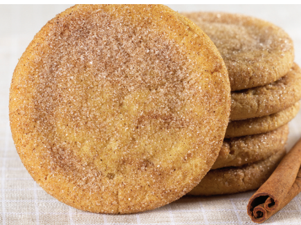
705 Snickerdoodle $22.00 2.5 lb. box with 40 pucks