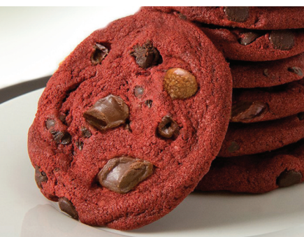
710 Red Velvet $24.00 2.5 lb. box with 40 pucks