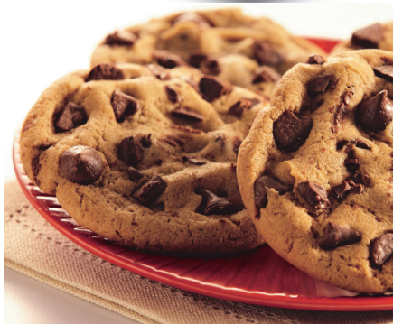
701 Chocolate Chip $22.00 2 lb. box with 36 pucks