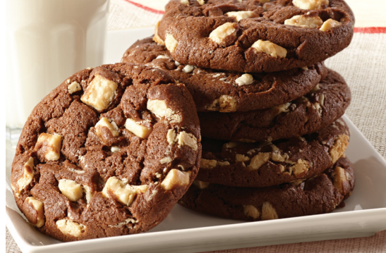
708 Double Chocolate with White Chunk $24.00 2.5 lb. box with 40 pucks