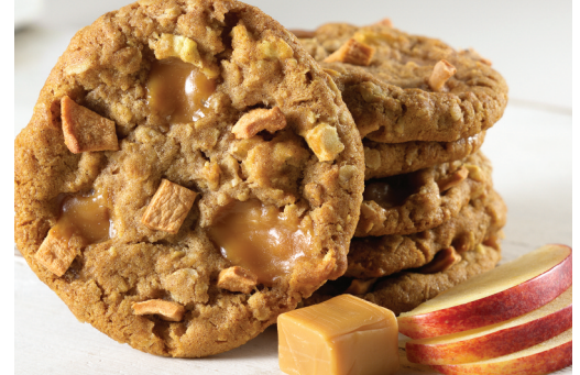
706 Caramel Apple Crunch $22.00 2 lb. box with 36 pucks