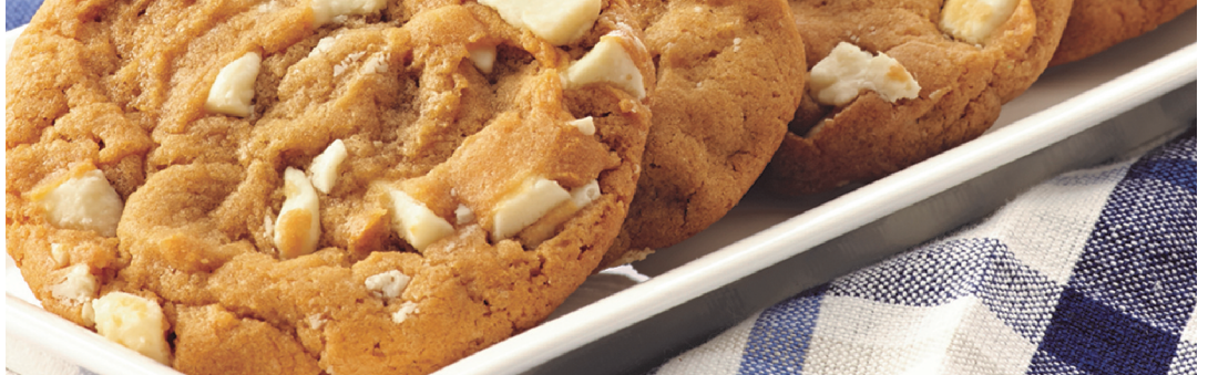
704 White Chocolate Macadamia Nut $22.00 2 lb. box with 36 pucks