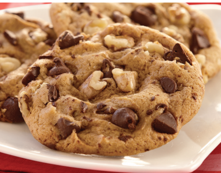
709 Walnut Chocolate Chip $22.00 2.5 lb. box with 40 pucks