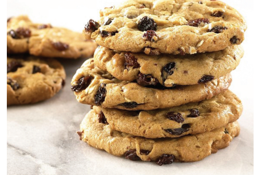
707 Oatmeal Raisin $22.00 2.5 lb. box with 40 pucks