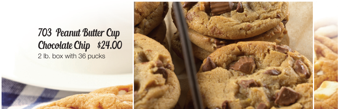
703 Peanut Butter Cup Chocolate Chip $24.00 2 lb. box with 36 pucks