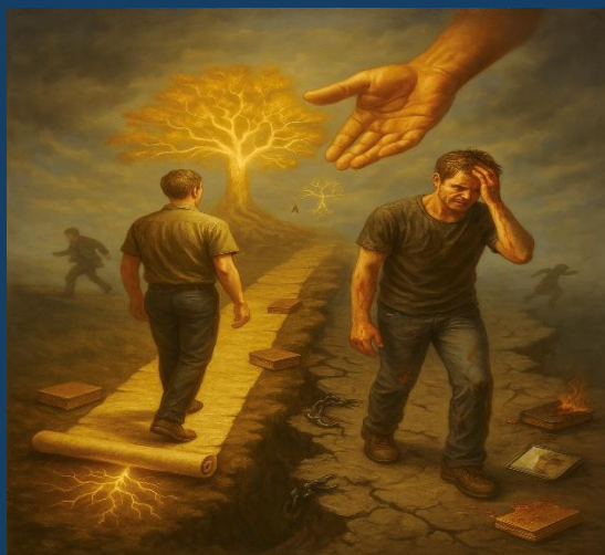
Learning by Wisdom or Learning by Wounds

I can conclude by saying that the only path to true independence is through wise dependence, but I won't. I will continue to say that the more you depend on God, the more independent you become, and the more you ignore Him, the more your "freedom" turns into chains.