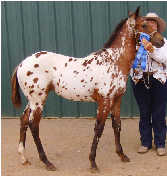
FVF Wind Serenade F3-2658

And get a foal with a coat pattern like one of these?