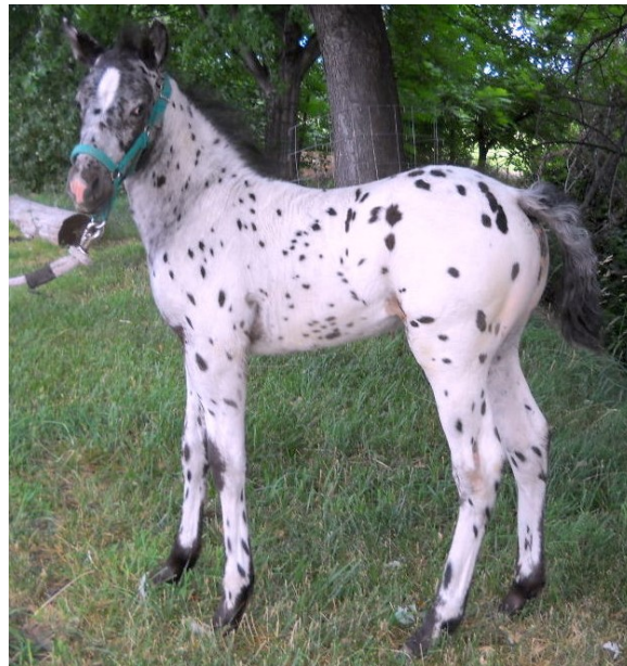
BCA Chats Tsumago F5-2701

The answer is yes. In fact, ALL resulting foals from this particular cross theoretically should have a coat pattern like the leopard foal or the near-leopard foal above 100% of the time. You might ask, "How is this possible?"