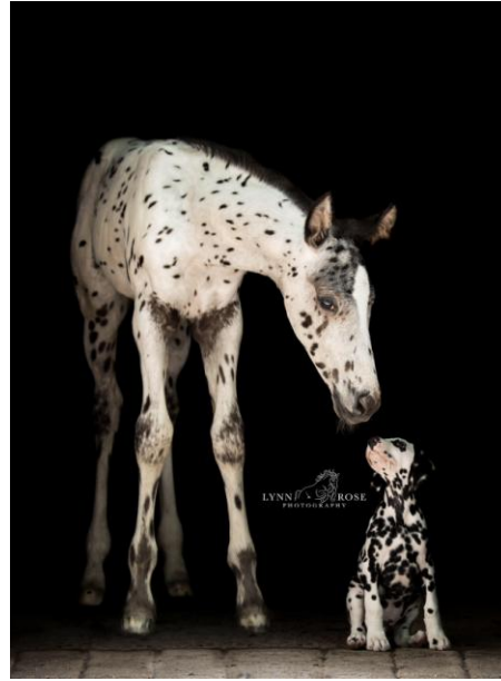
MH Sonic Boom F4-2737