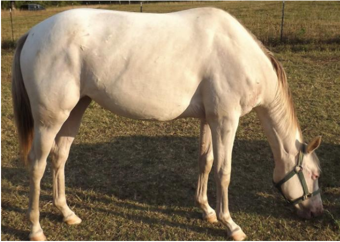
Champagne Amber Lite #2736