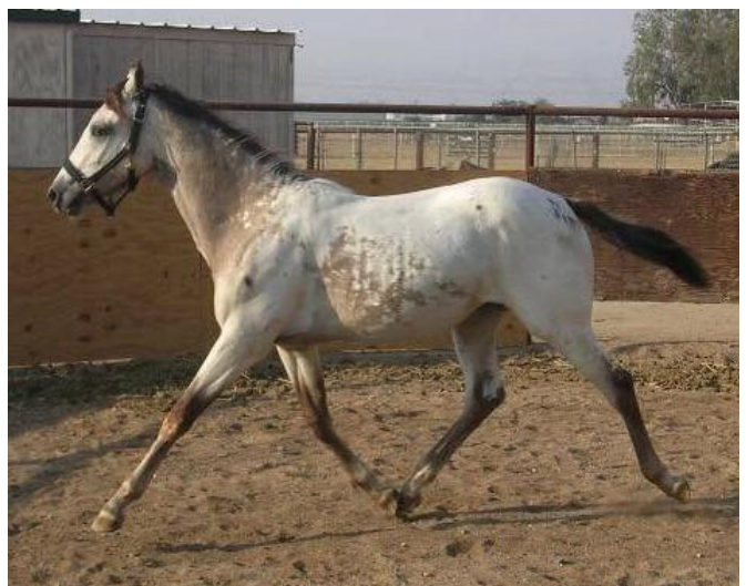
Chelseas Honey Whirl, a buckskin fewspot mare we recently purchased from Hawkeye Ranch (pending ICAA registration)