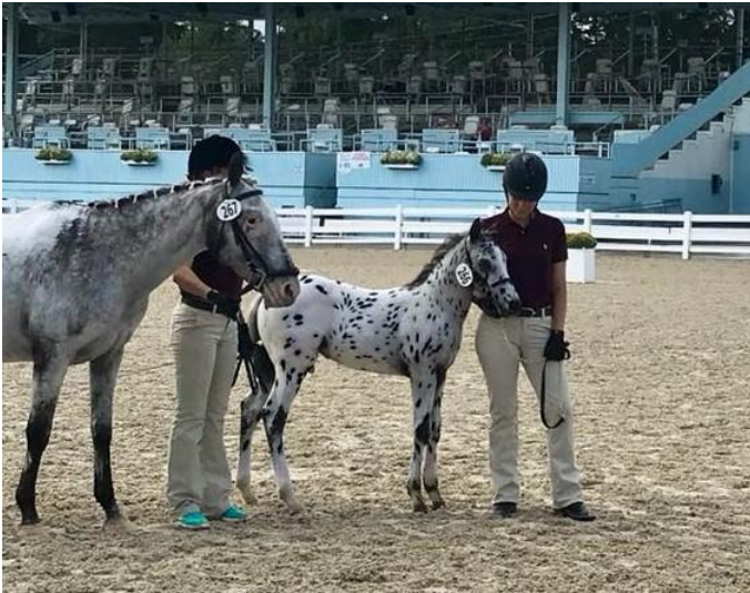
This picture was taken at Dressage at Devon – MH Sonic Boom (F4-2737) was entered in the Colts of the Current Year class and was adored by every single person he walked by on his way to the ring. He had a line of little girl admirers looking to give him love and attention as soon as the class was over.

The Newsletter is available almost exclusively online. Hard copies are available via snail mail for current members who request them.