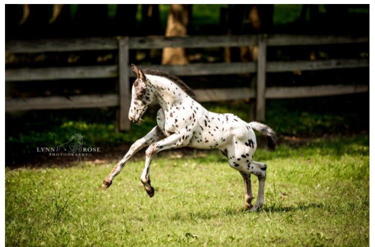
MH Sonic Boom F4-2737

Stallion Reports are due before the end of December. Reports should list all mares bred, regardless if they are another breed or grade. Free to current members when filed on time.