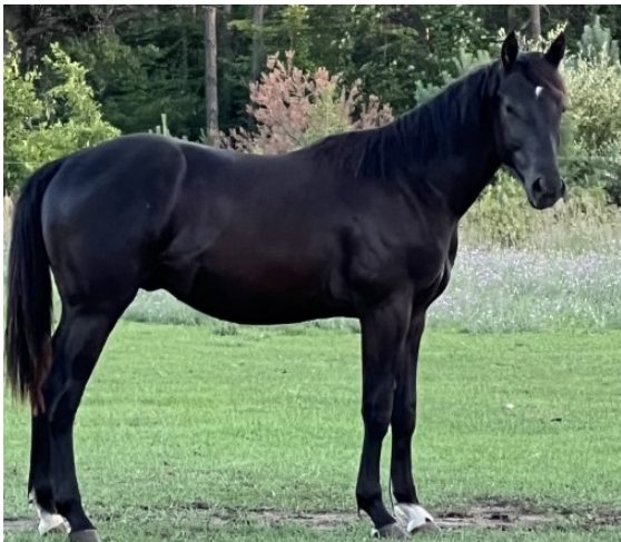
Plaudit Storm Dancer MA (F5N) Black Solid Colt Owned by Sean Elliott