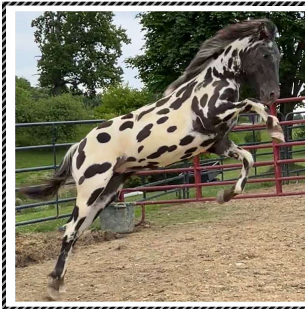
MHS Mintaka of Orion (F5)

Show off your ICAA horses on the ICAA Facebook Page!