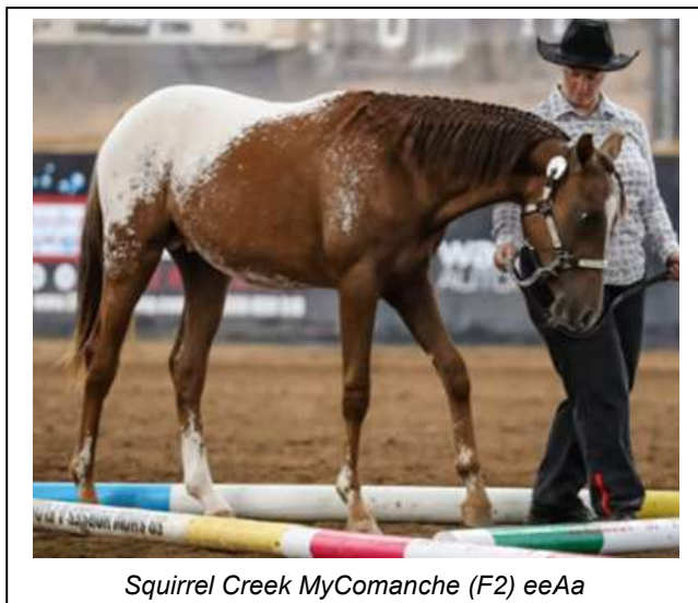
Squirrel Creek MyComanche (F2) eeAa

Now that the codes on your base color test results have been "de-coded" you can be certain that what you're buying, be that a foal or a breeding to a stallion, is what you're paying for. While many seem to prefer the sharp contrast that the black base color provides in our Appaloosas, please try to think beyond "black and white" when buying or breeding. Our genetic base in the higher generation Appaloosas is so limited already. And who doesn't love a striking bay or flaming red base coat anyway!