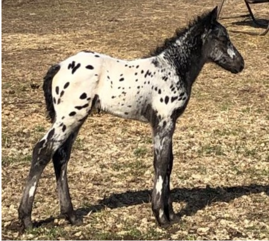
BCA Yamas Ocelot (F7) Black Near-Leopard Colt Owned by Charles Potts, Blue Creek Appaloosas