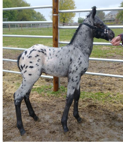
BCA Yamas Yellowhawk (F7) Black Near-Leopard Bolt Owned by Charles Potts, Blue Creek Appaloosas