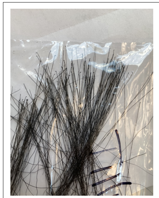
Normal hair sample on right.