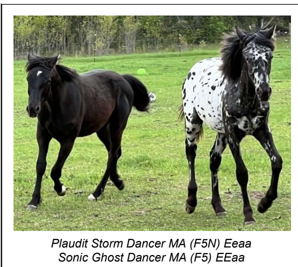
Plaudit Storm Dancer MA (F5N) Eeaa Sonic Ghost Dancer MA (F5) EEaa

Now let's put Extension and Agouti possibilities together and see what we get: