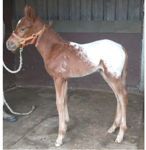
BCA Red Deers Chabudo (F7) Chestnut Snowcap Filly Owned by Charles Potts, Blue Creek Appaloosas