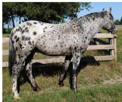
BCA Chats Nuksay (F5) BCA Zamos Replica (F6N) → ← MHS First Chance (F4)