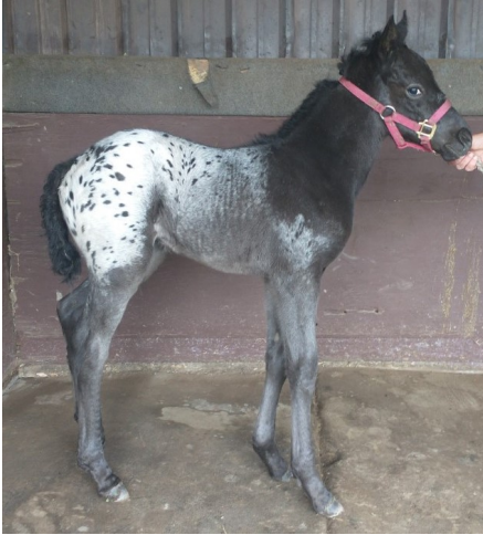
BCA Yamas Noctiluca (F7) Black Blanketed Filly Owned by Charles Potts, Blue Creek Appaloosas