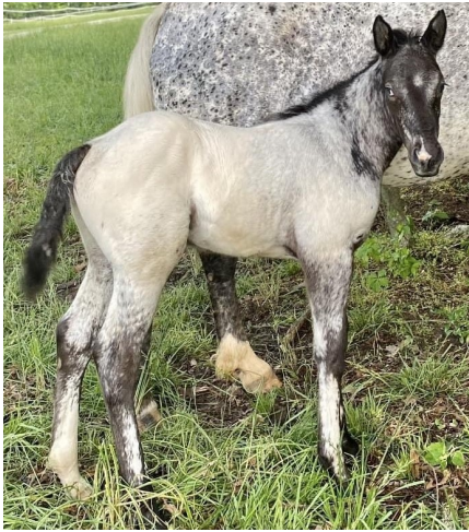
RA Ghostwind Ace (F5) Black Near-Fewspot Colt Owned by Sherri Ritter