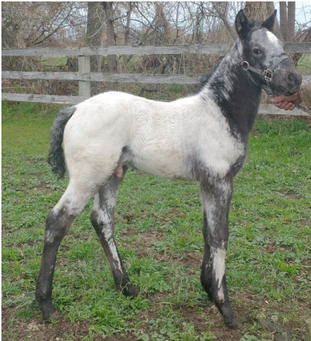
BCA Yamas Blue Herron (F7) Black Near-Fewspot Colt Owned by Charles Potts, Blue Creek Appaloosas