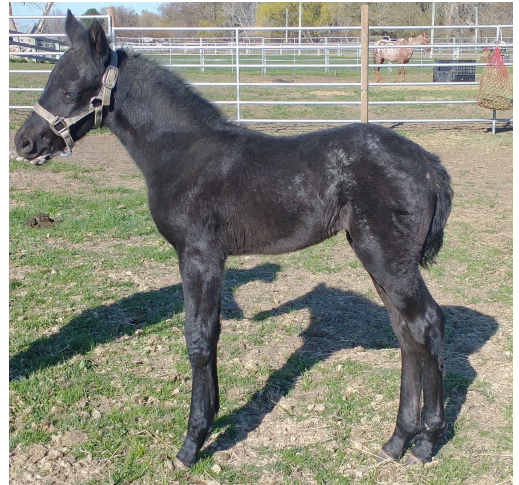
BCA Yamas Tadaima (F7) Black with Spots over Back/Hips Filly Owned by Charles Potts, Blue Creek Appaloosas