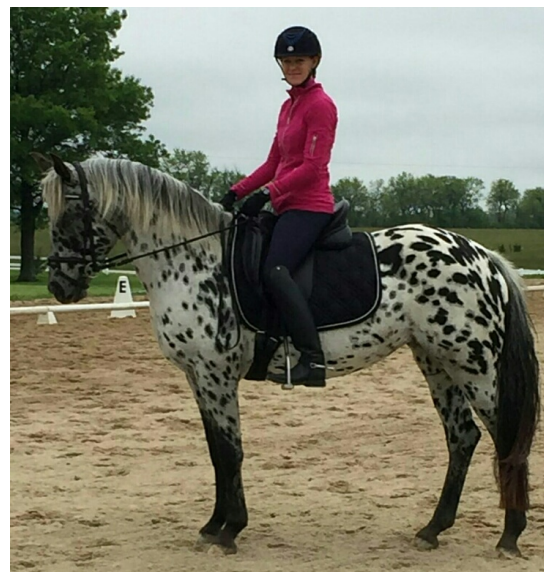
BBA Bluesmoke Beauty (F2) Owned by Virginia Foxx