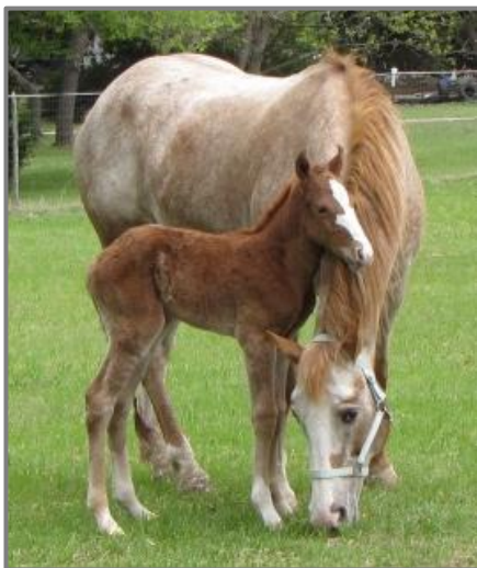
"Honey" and Smart Rockin Rosie

<-- See Ima Rockin Secret in the Stallion Showcase on the ICAA website