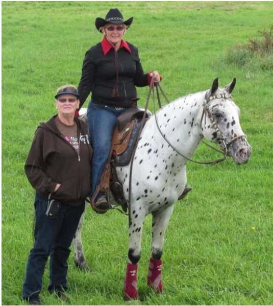
BRANDONS SUN BEAR F3-2263

See larger pictures and get more information on these stallions on the ICAA website What's New page and on the Facebook page linked above.