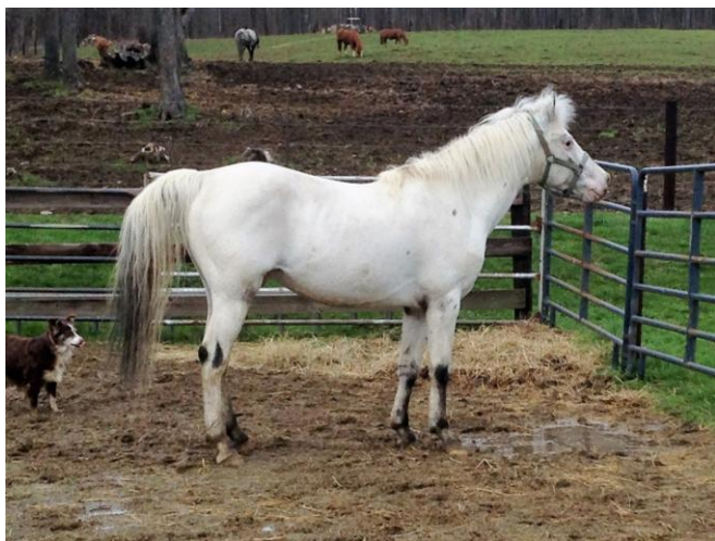
HHR IMA RAZZLIN BEAR F2-2538