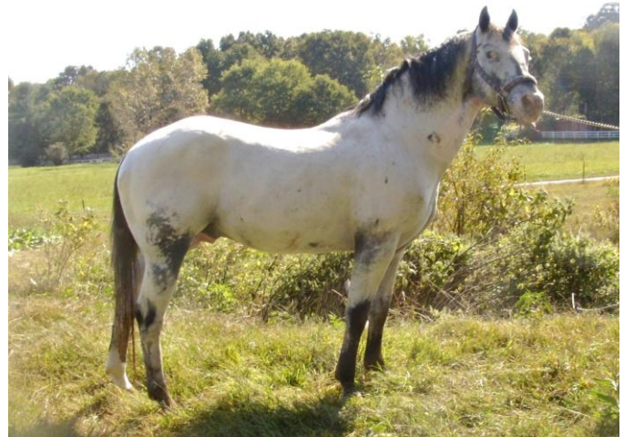
RAJUNS ROYAL PRINCE F4-2619

ALL OF THESE STALLIONS HAVE BEEN TESTED AND ARE 5-PANEL NEGATIVE!