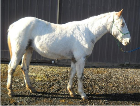
GW Cheveyos Sunspot F5-2719, 5-Panel N/N Owned by Charles Potts