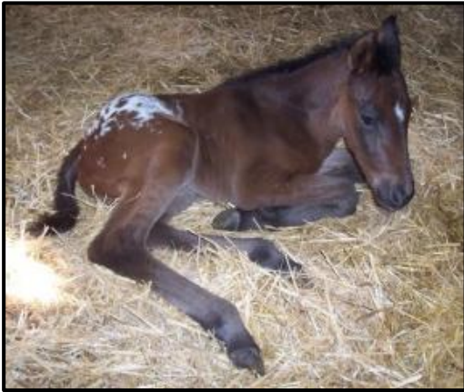
Ima Rockin Secret F2-2711 as a foal

stallion. But again it was not meant to be and "Belle" had a dystocia and had to have an emergency C-Section which resulted in a dead-born filly and the mare needed several Plasma and Blood Transfusions.