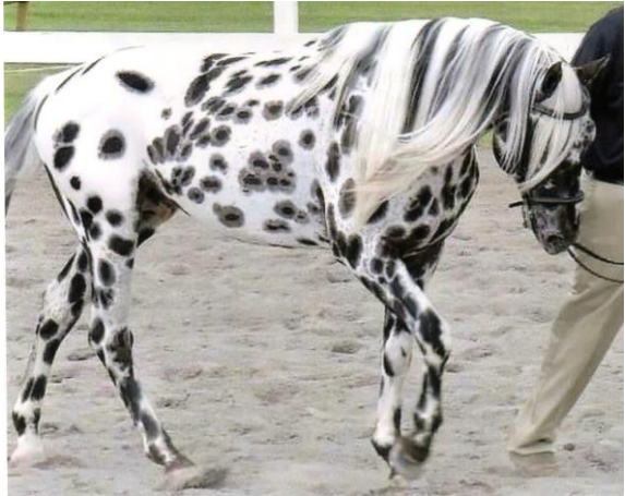
CTR Super Sonic F4-2716 Owned by Renee Dubyk