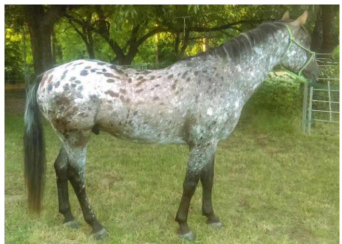
IMA ROCKIN SECRET F2-2711