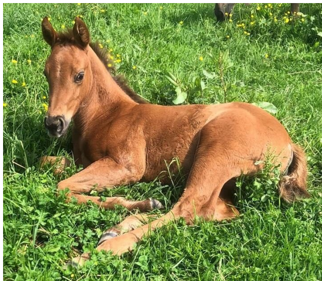
HHR Get Zippin Around (ICAA pending), aka; Pumpkin

I really like being outdoors. I enjoy hunting, especially pheasants and Canadian geese with our family's Gordon Setter. I also like fishing, working with and caring for our setter and two German Shepherds, and 4-wheeler rides with my dad in Tamarack Swamp. I have fun helping my brother film wacky movies with his camera, and going swimming with my mom. On Wednesday nights, my mom and I watch the Chicago series!