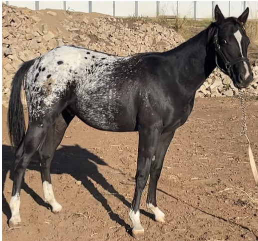
Cutthroat Speckle MA F3-2823 Black Blanketed Stallion Owned by Kirk Maxey - CAMAHF