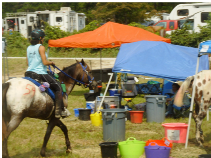
FVF Thunderbolt – ANKER 2021