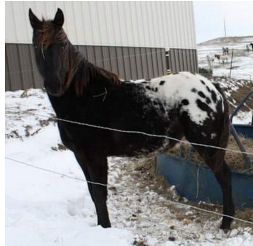
NorthStar BlackEagle F5-2825 Black Blanketed Stallion Owned by Kyle or Susan Magnuson