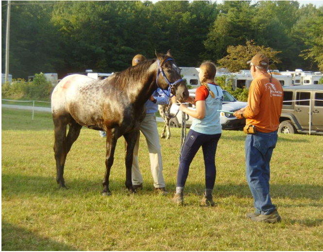
FVF Thunderbolt – ANCER

The Endurance and Distance events have long been dominated by the Arabian Breed but the Appaloosas are now giving them some real competition. The multi-generation App to App horses are proving their blood and showing that they have the speed and heart and abilities that their history suggests. These Appaloosas can do so much, it is just up to us as owners and breeders to get them out there to show it off. I would highly recommend the Endurance and Distance Sport for all interested Appaloosa owners.