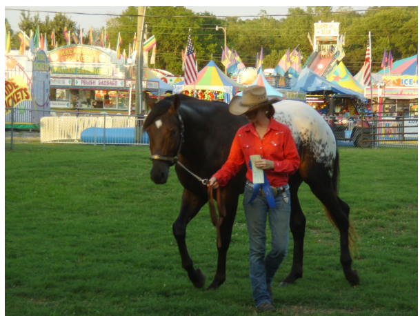
FVF Thunderbolt, Dekalb County Fair 2012