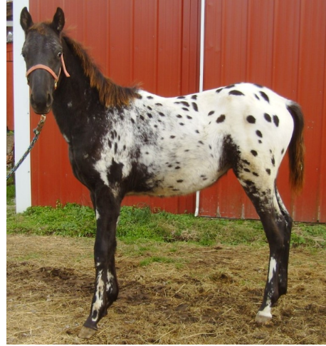
FVF Gunsmoke F6-2816 Black Blanketed Stallion Owned by Jan Dobson