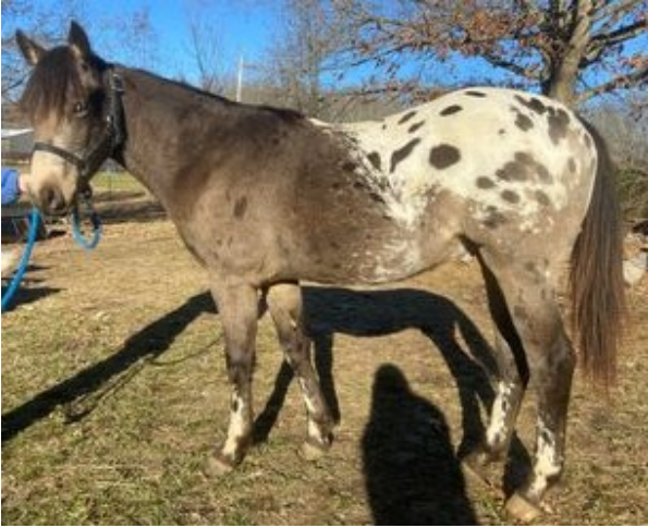
MHS Armageddon F4-2814 Buckskin Blanketed Stallion Owned by Whitney Wrzesniewski