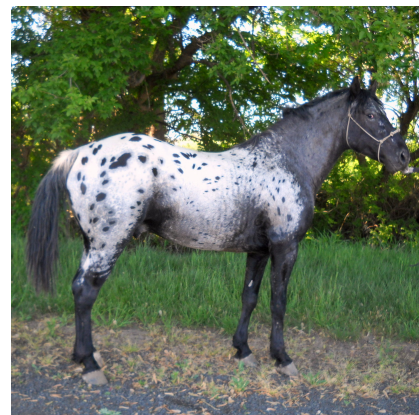
He will be missed by many in our ICAA family.

It is with great sadness that we must announce the passing of BCA Tofoz Chatanga F5-2646. He was a phenomenal stallion, with many offspring and grand-offspring registered with ICAA.