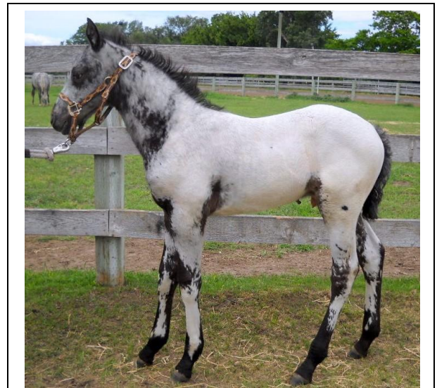
BCA Chats Yamahawk F6-2699 Owned by Charles Potts, Blue Creek Appaloosas. Mr Potts always sends good pictures of his horses and that is very much appreciated! Notice how all four legs can be seen clearly for a good description. This baby is also very clean.

Never worry about sending too many pictures. Sometimes that extra shot of a heel marking can be the determining factor