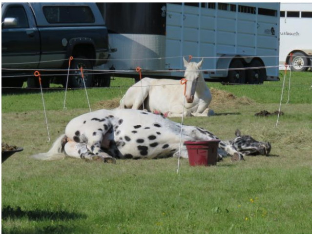
Naptime for Stars Wildfire SL after a hard day's work!