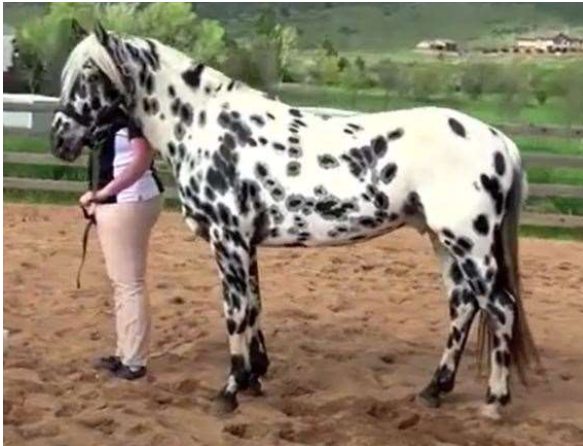
CTR Super Sonic, F4-2716 Owned by Kirk Maxey-CAMAHF First Place SR Stallion, Most Colorful Stallion, Open Most Colorful

Show off your ICAA horses on the ICAA Facebook Page!