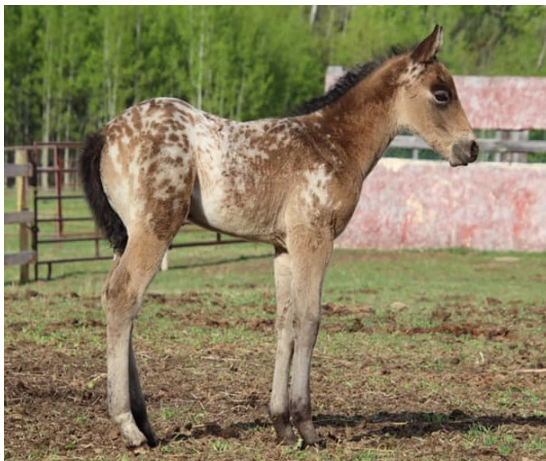
2021 Buckskin Filly (F4 pending) out of WA Miss Silver Sand, F3-2763 and out of AR Ima Silver Coyote, F4-2767 Owned by Fiona Plunkie