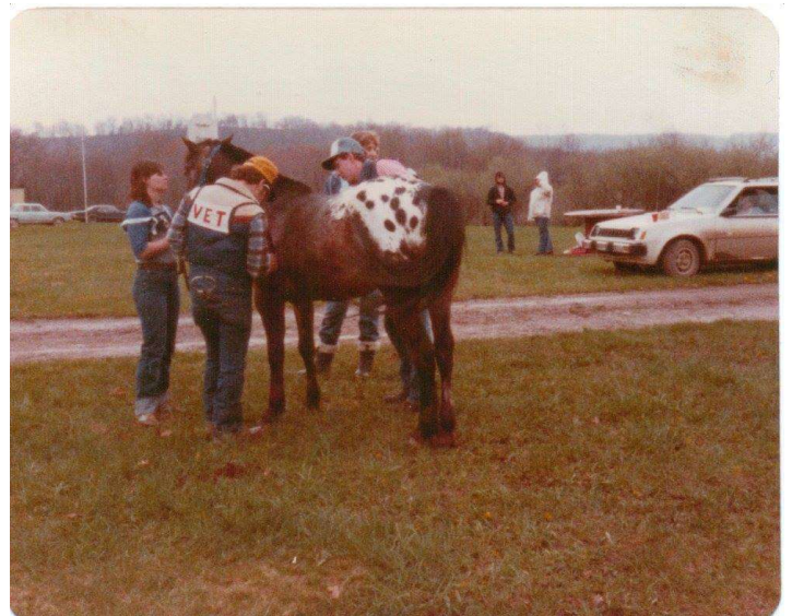
Cherokee Handprint Chief at a CTR in the early 1980's

So the search took me back to where I purchased my last Appaloosa; a breeding farm not far from me. Hydaways PJ Sunchic was a great little mare that I bought as a four-year old; an easy going, steady Eddie type that did not care what the other horses were