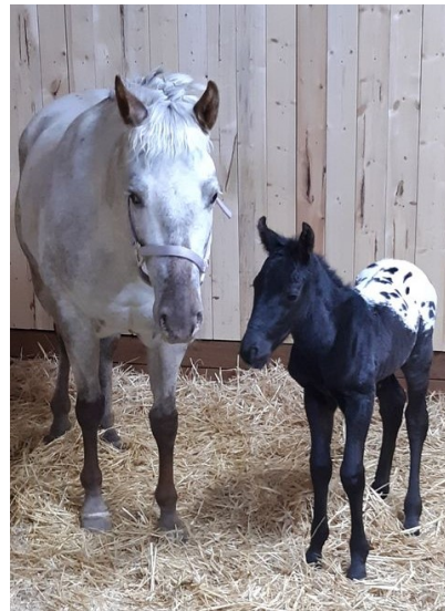
HHA Twisted Iron (F4 pending)