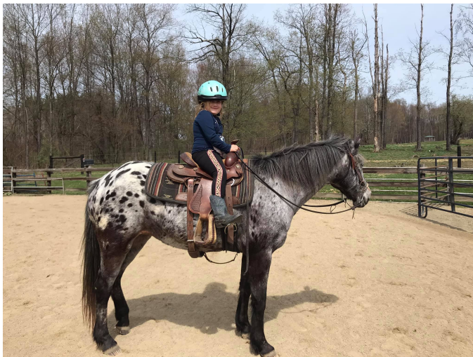
Dazzlin Sugarbritches, #2457 with a student at Horizon Hills Ranch

The Newsletter is available almost exclusively online, other than for those who request that a hard copy be mailed to them. We also send a hard copy to new members for one year. If after the one year any new members desire to continue to receive a hard copy, please let us know.