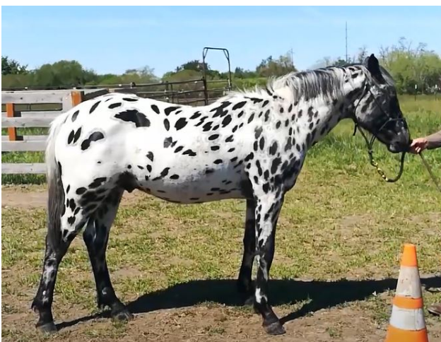
BCA Zamos Tuusi, F6-2790 Black Leopard Colt Owned by Charles Potts, Blue Creek Appaloosas