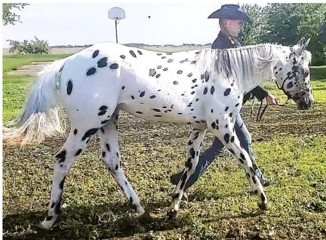
YM Taks Two To Tango, F4-2792

"Cupid" is an up and coming yearling colt that is doing extremely well in ApHC shows and was First Place JR Stallion in our 2021 ICAA Virtual Halter Show. He is by Dream Makers Mirage and out of Echos Harliquin Moon.