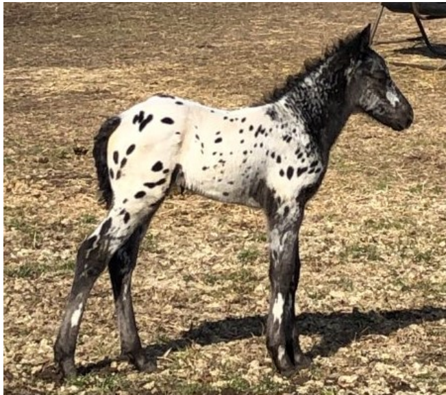
BCA Yamas Ocelot, F7 (pending) Colt By BCA Chats Yamahawk F6-2699 and out of BCA Zamos Chamula

Six years can make quite a difference as this spring we are having our second crop of F7s. One of our persistent foils is the large ratio of colts to fillies. In 2016 we had four colts, 2 F6 and 2 F5. In 2020 we had four colts all F6, and in 2021 3 colts and one filly, 2 F7 colts and one F6 filly and 1 F6 colt. In 2022, all three F7s were colts, along with two F6s.