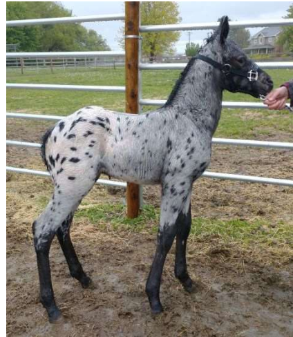
BCA Yamas Yellowhawk, 2022 F7 Black Colt by BCA Chats Yamahawk F6-2699, and out of BCA Heartbeat Pasxa. Owned by Charles Potts, Blue Creek Appaloosas.