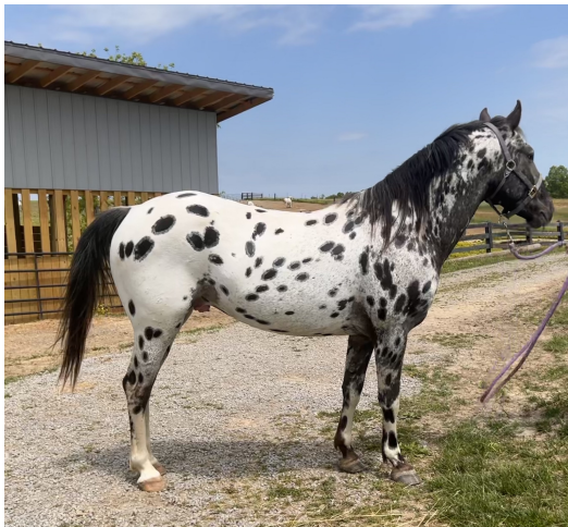
MHS Still Orion (F4) Black Near-Leopard Stallion Owned by Tom and Karen Freund, Mount Hope Stables