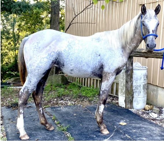
KR Prairie Smoke Patty (F4) Black Near-Fewspot Filly Owned by Sherri Ritter