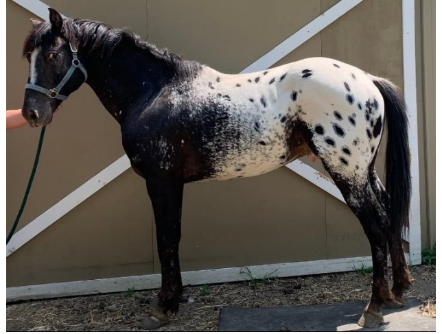
Sumrall Gun Smoke (F5) Dark Bay Blanketed Stallion Owned by Bre Ramirez