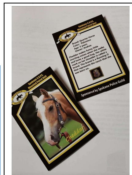
Sample MPU Trading Cards

These meetings are very informative and a lot of input from members is always welcome!