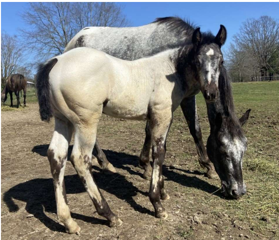
Another one of our new 2023 babies, WRZ Black Fire Poseidon, by DREA Rainwaters Fire and out of FVF Black Satin (F5). This colt is owned by Whitney Wrzesniewski.