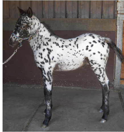
BCA Zamos Konobo F6-2753 Black Leopard Stallion, 5-Panel N/N Owned by Charles Potts, Blue Creek Appaloosas