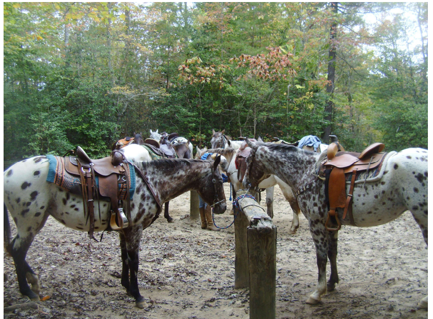
Some of the Foggy Valley Farm Appaloosas