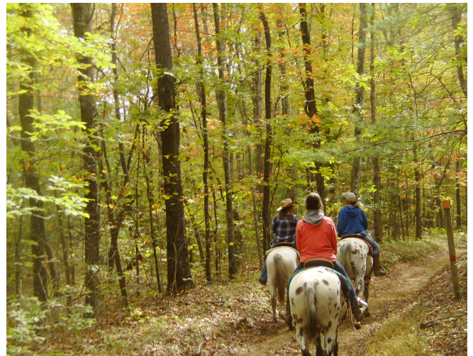
Pretty fall day for a ride.

So, back home we go, tired and scared for our girl Angel. We try to get things packed into the trailer but suddenly it's not so much fun. It was a mystery to us as to how Angel had cut her leg so bad right there in the yard until we discovered blood and hair on the bottom of the door of a shed on the barn. Apparently she had chased a cat that ran under the door and Angel could not stop in time and her leg slid under the door and she sliced it to the bone on the tin as she pulled it out.