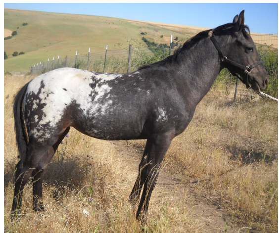
BCA Chats Kayuna F5-2751 Black Snowcap Mare, 5-Panel N/N Owned by Charles Potts, Blue Creek Appaloosas