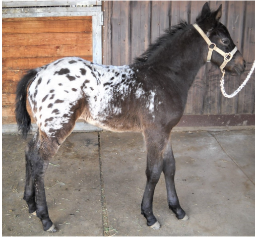
BCA Zamos Juliaca F6-2752 Black, Blanketed Mare, 5-Panel N/N Owned by Charles Potts, Blue Creek Appaloosas