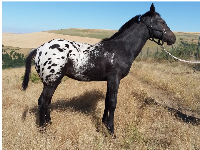
BCA Zamos Juliaca F6-2752

The short answer lately is from Caw Pawa Laakni: They Are Not Forgotten . It is a Sahaptian place name atlas of the Cayuse, Umatilla and Walla Walla Native Americans.