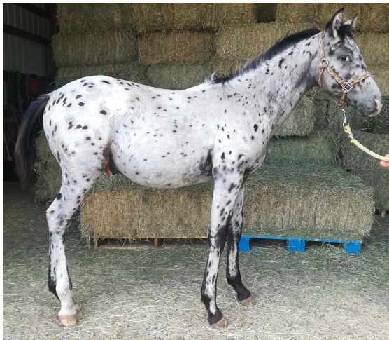
BCA Chats Nuksay F5-2754 Black Near-Leopard Stallion, 5-Panel N/N Owned by Charles Potts, Blue Creek Appaloosas