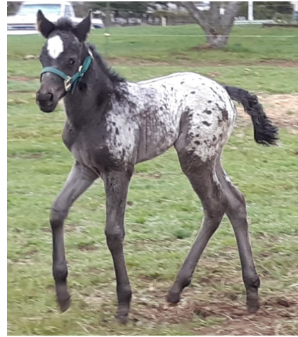
HHA Soxs To Be You, F3-2803 Black Blanketed Filly Owned by Amanda Hubbert