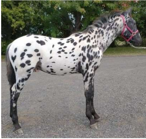
BCA Zamos Muldoon, F6-2809 Black Near-Leopard Colt Owned by Charles Potts, Bluecreek Appaloosas