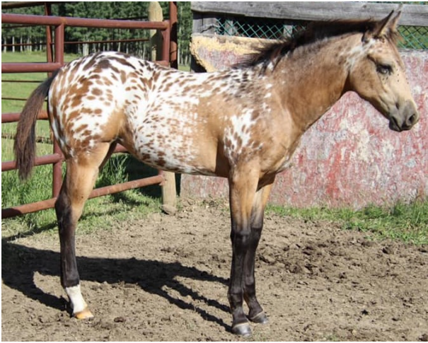
AR DoubleLacedSilver, F4-2804 Buckskin Near-Leopard Filly Owned by Fiona Plunkie