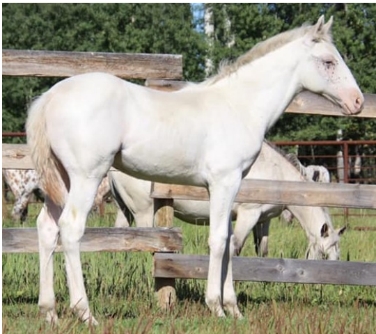
ARMightySilverCanvas, F3-2807 Chestnut Fewspot Leopard Colt Owned by Fiona Plunkie