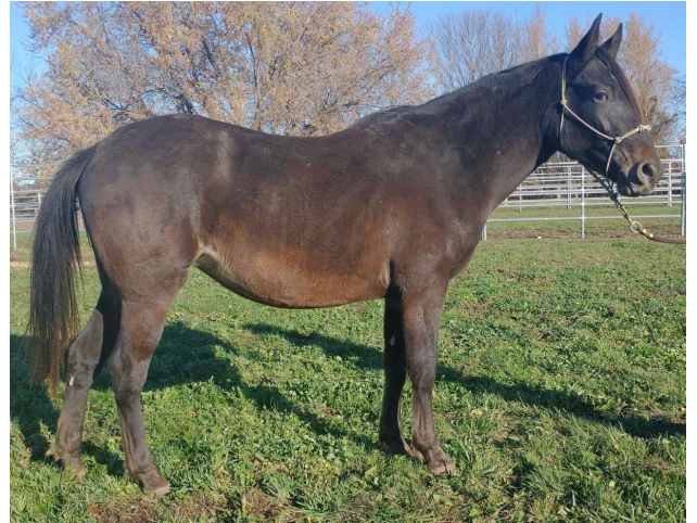
Ghostdance Juma, F5-2812 Dark Bay Solid LP/LP Mare Owned by Charles Potts, Bluecreek Appaloosas