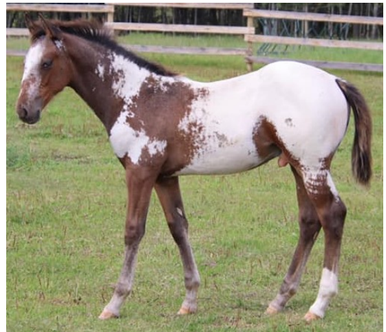
ARNorthernSilverSign, F4-2806 Bay Near-Fewspot Leopard Colt Owned by Fiona Plunkie