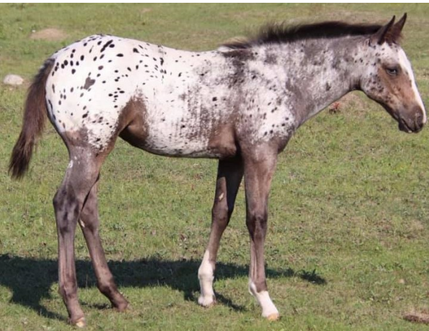
AR Silver CoyoteRose, F4-2805 Dark Bay or Brown Near-Leopard Filly Owned by Fiona Plunkie