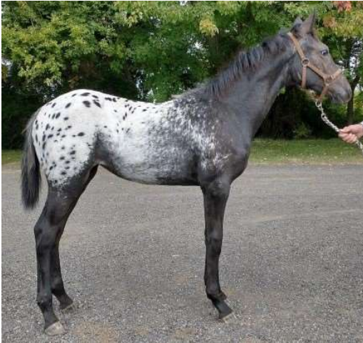
BCA Yamas Otamba, F6-2811 Black Blanketed Mare Owned by Charles Potts, Bluecreek Appaloosas