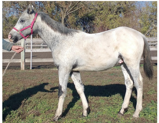
Iron White Star, F7-2808 Black Near-Fewspot Leopard Colt Owned by Charles Potts, Bluecreek Appaloosas