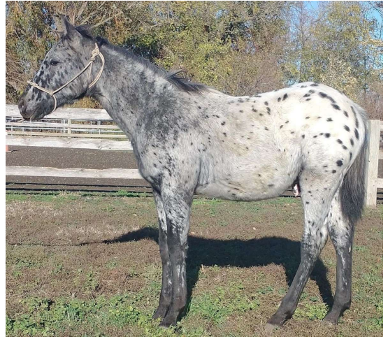
BCA Yamas Misqualu, F7-2810 Black Near-Leopard Colt Owned by Charles Potts, Bluecreek Appaloosas