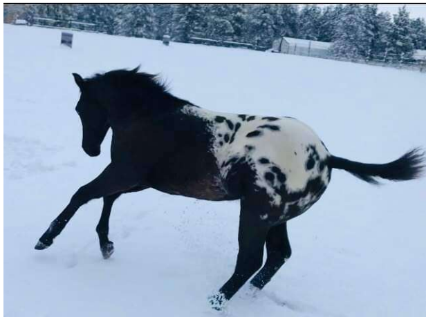
HHA Twisted Iron, F4-2801

Show off your ICAA horses on the ICAA Facebook Page!