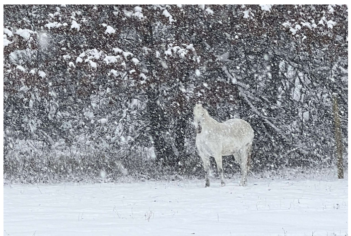
FVF Sabrina Shine (F5)