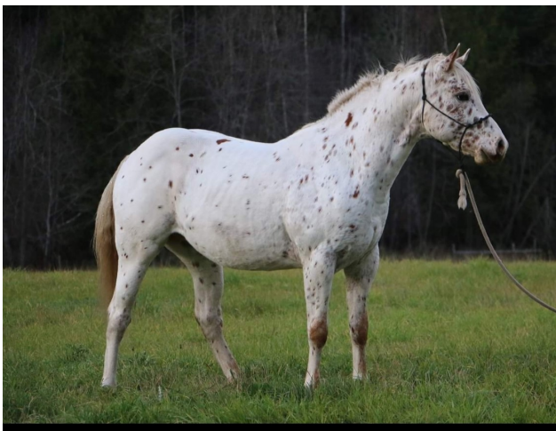
AKA Ima Boogie Star (F3) Chestnut Leopard Gelding Owed by Dawn Beach-Spencer, Smokin' True Ranch