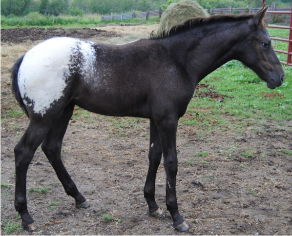
Total Lunar Eclipse (F6) Black Snowcap Filly Owned by Dan Bjergo, Primed~N~Painted Ranch