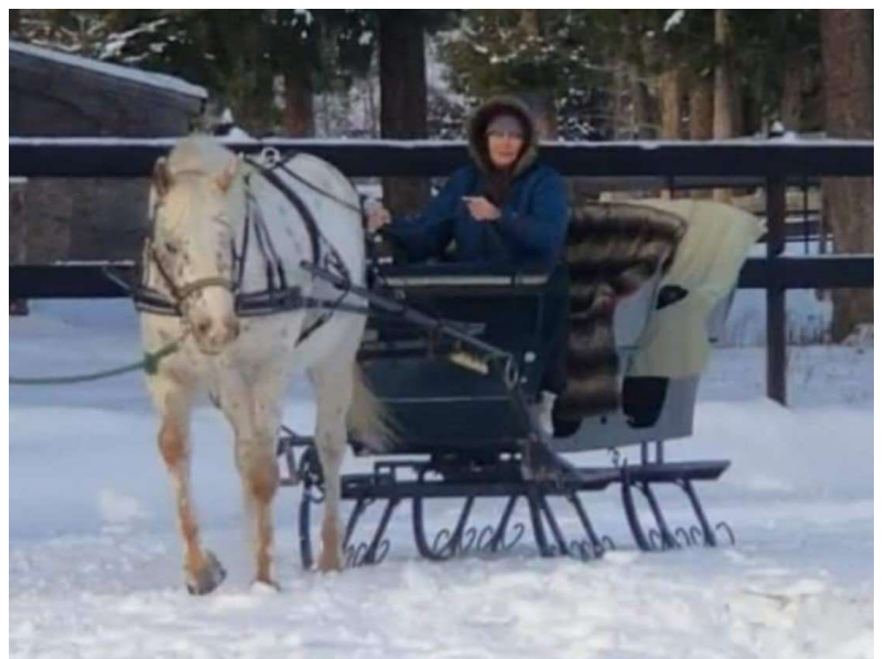
Dawn Driving Ima Boogie Star (Amos) (F3)