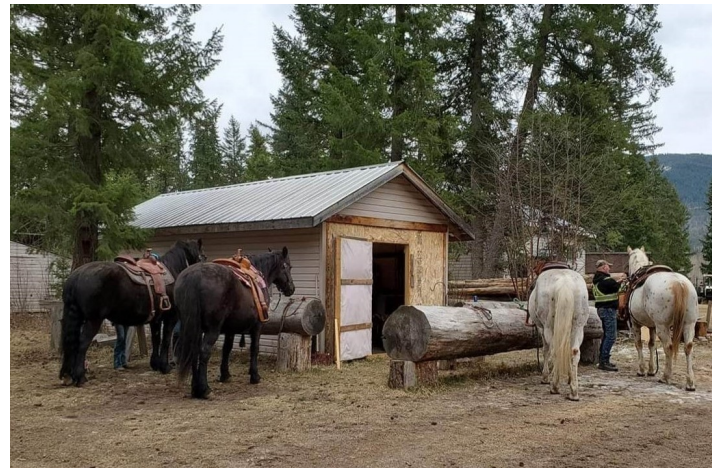
The team is going to work today" ~ Smokin' True Ranch

Thank you Dawn and Smokin' True Ranch for all of the beautiful photos provided (I wish we could use them all) and for showing us how all of your horses have jobs, work hard, and promote the athleticism, temperament, and versatility of the Appaloosa!