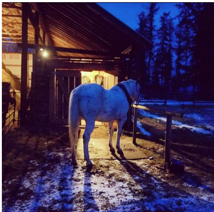
"Amos" on a Beautiful Winter Night at Smokin' True Ranch

"The Nez Perce bred Appaloosas for transport, hunting, and battle. The modern Appaloosa is still an extremely versatile horse. Its uses include pleasure and long-distance trail riding, working cattle and rodeo events, racing, and many other Western and English riding sports. The breed also is frequently seen in film and on television, where its distinctive markings can steal a scene. It's a friendly, gentle horse whose loyalty makes it an especially rewarding and enjoyable companion." Katherine Blocksdorf