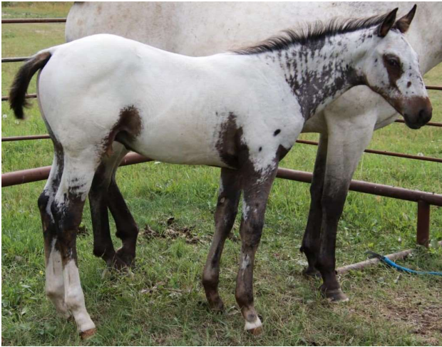
AR Brite Silver Wheeler (F4) Bay Near-Fewspot Colt Owned by Fiona Plunkie, Antler Ranch