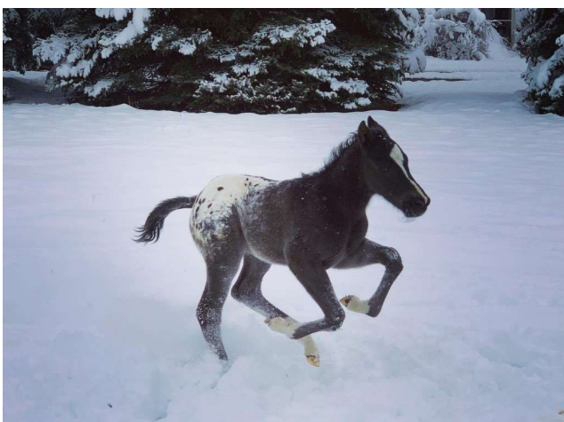
Cutthroat Speckle MA (F3) at 8-Hours Old