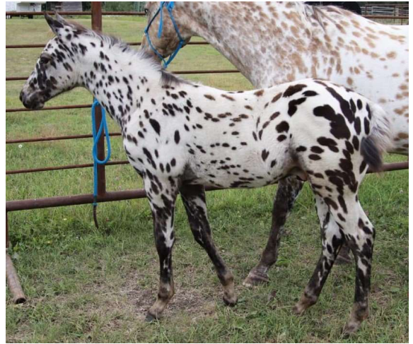
AR Silver Arctic Skeeter (F4) Buckskin Leopard Stallion Owned by Fiona Plunkie, Antler Ranch