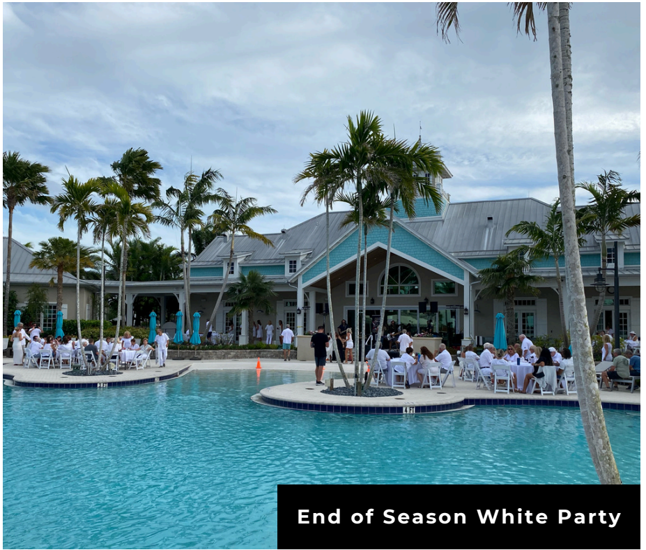
End of Season White Party