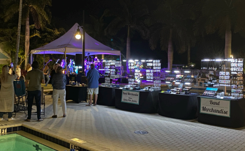
Alter Eagles Concert