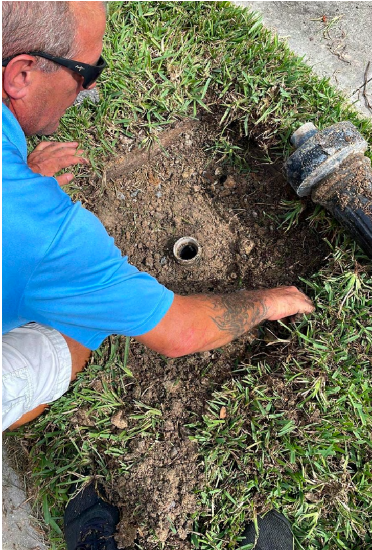
Spinnaker/Dockside Sign Repair