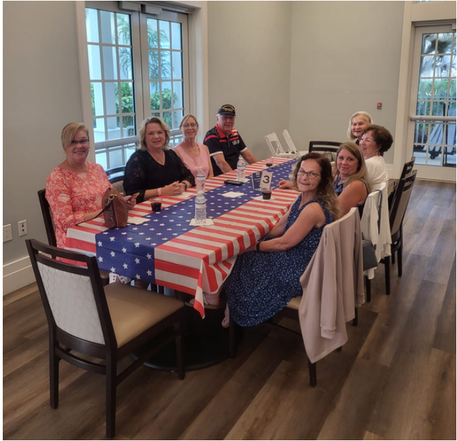
Residents gathered at the Island Club Building to celebrate Veterans Day.