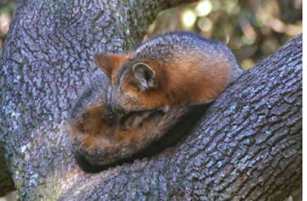
Gray fox, FWC