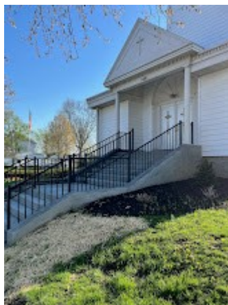
St. Therese received new siding, steps and handrails. Overgrown shrubbery was replaced with new landscaping.