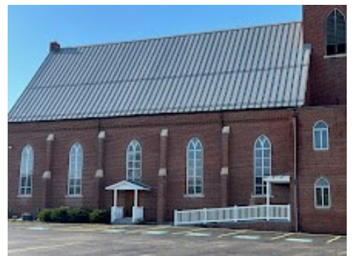
St. Clement received a new steel roof replacing the storm damaged slate roof.