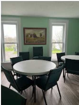
The Parish Office building received a new HVAC system and renovations to the second floor. Included were repairs of water damage, an update to the restroom, reconfiguration of doorways, new flooring & paint.