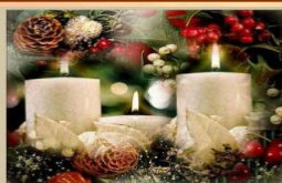
Advent by Candlelight

A retreat for Catholic Women from Holy Family & the Massillon Parishes