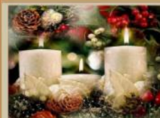
Advent by Candlelight