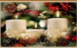
Advent by Candlelight

Our imagination can help us calm ourselves in moments of great anxiety. I've reached my hand to the seat next to me, imagining I can hold His hand in moments of concern. When I was going through a particularly bad time in life I imagined I was standing behind the Lord, peering over His shoulder while holding onto the cincture at His waist. When things got ugly, I hid my eyes behind His back. When I was brave I looked over His shoulder. Invite Jesus in, intimately. He will be the calm voice, the soft touch, the shoulder to lean on when times are tough.