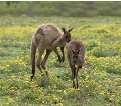
Western grey kangaroo