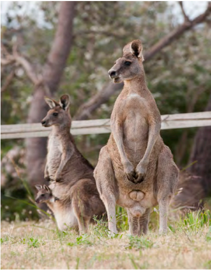
Eastern grey kangaroo

Kangaroo sex identification: (males are the larger specimen in each image).