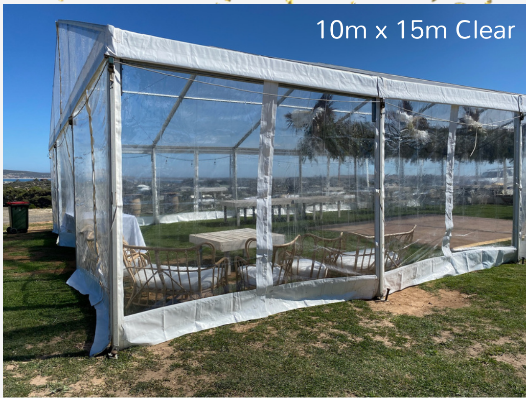
10m x 15m Clear