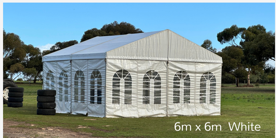
6m x 6m White