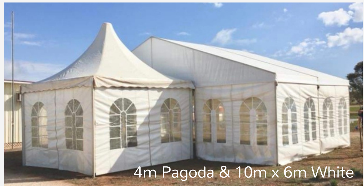
4m Pagoda & 10m x 6m White