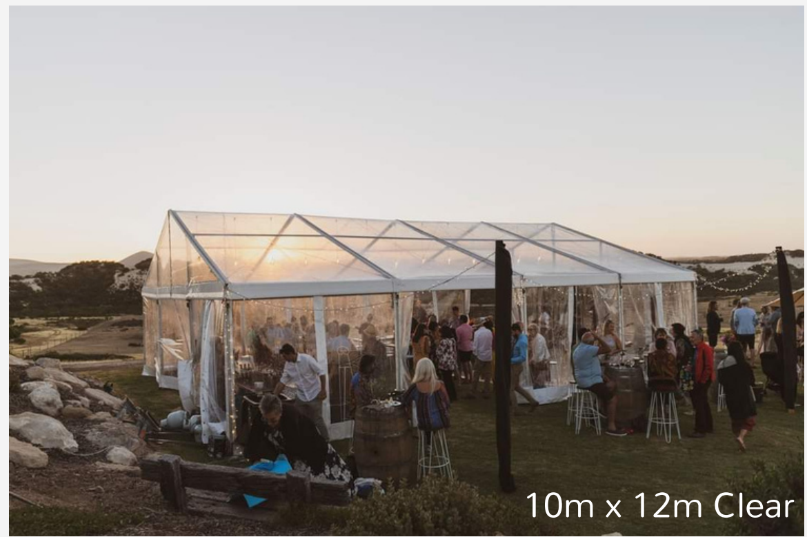
10m x 12m Clear