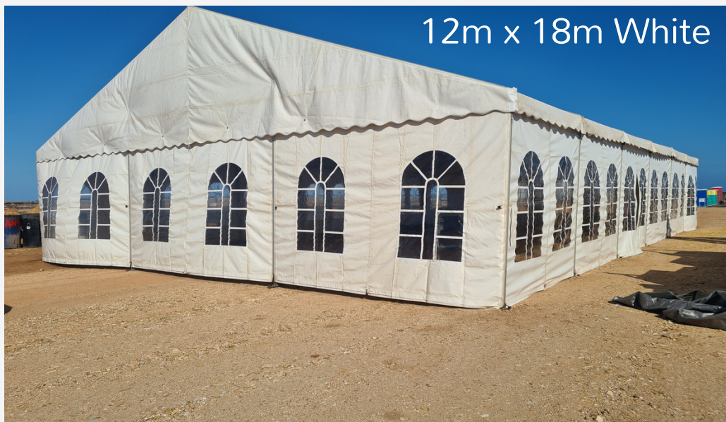
12m x 18m White