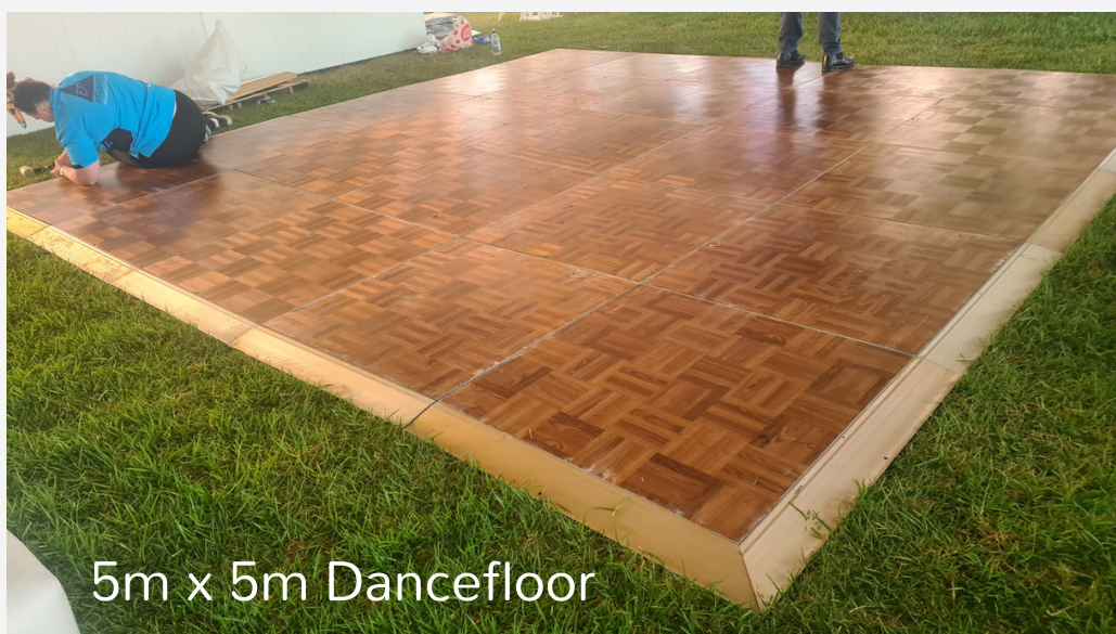
5m x 5m Dancefloor