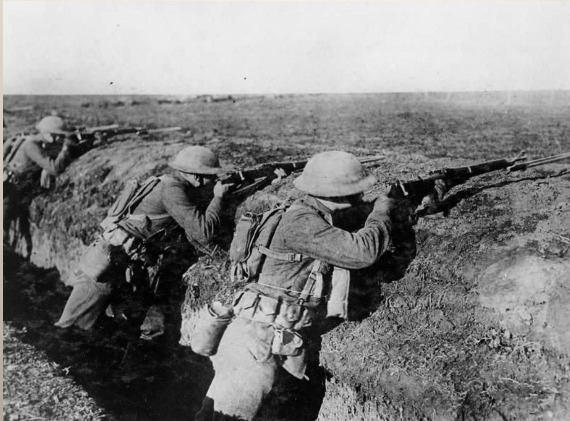
Springfield Model 1903