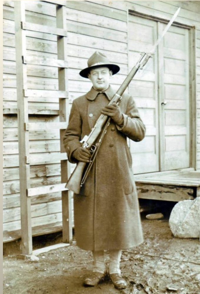
Rifle Model of 1917 Eddystone – Remington - Winchester