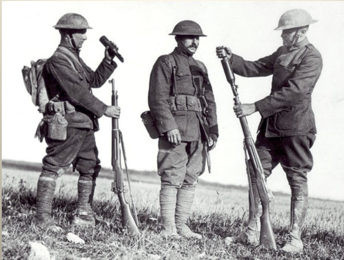
1917 Rifle w/ VB Rifle Grenade Launcher