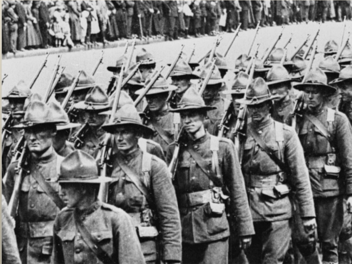
Krag Model 1898 Rifles