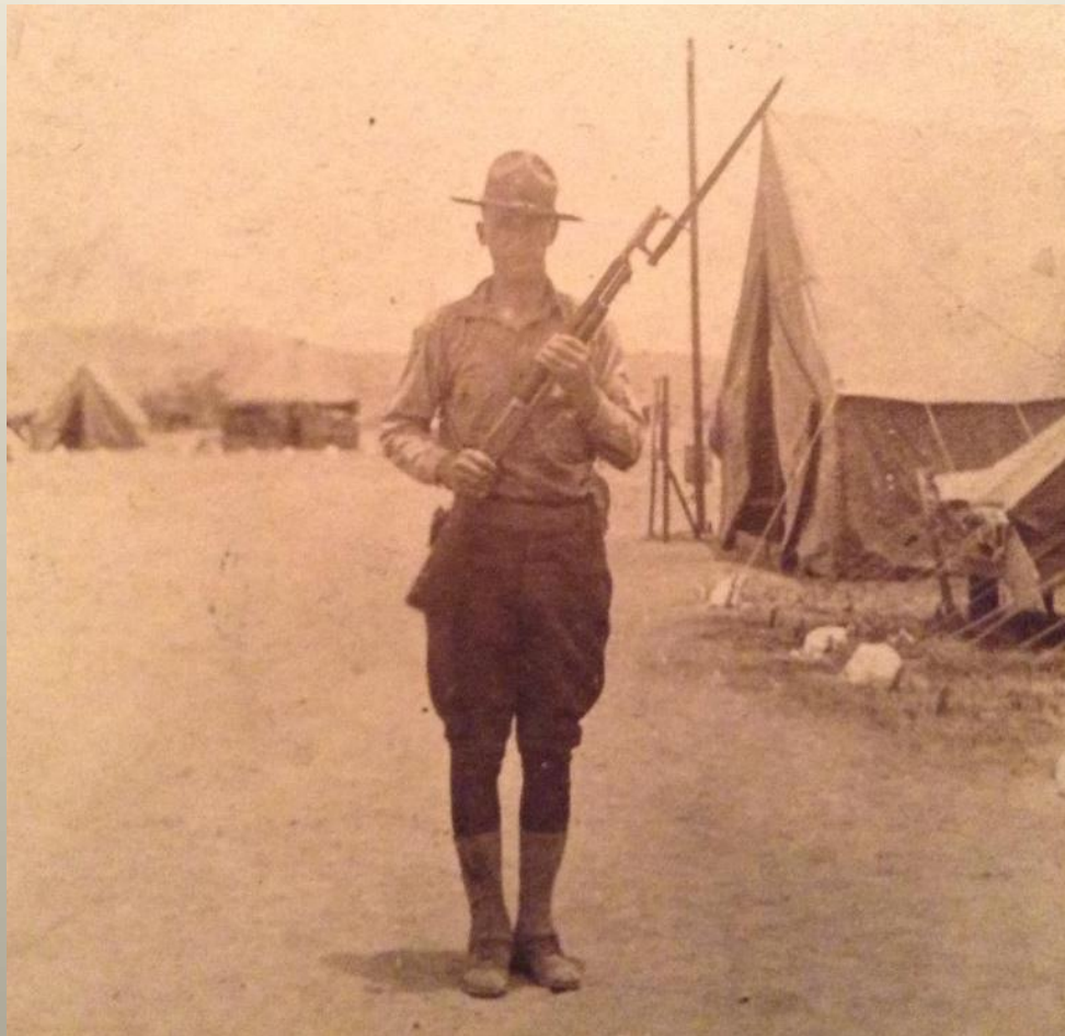
Remington Model 10-A Shotgun