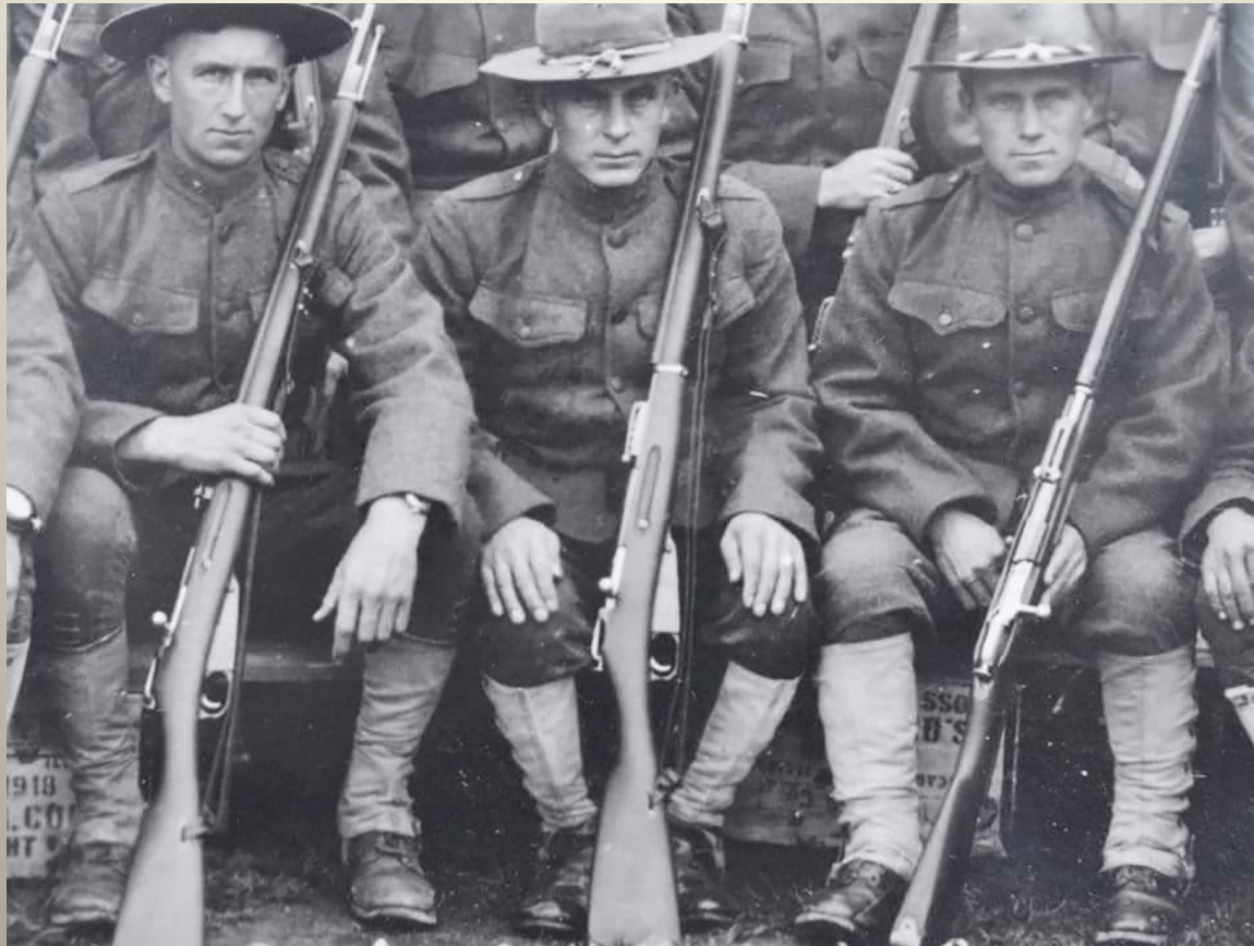
Remington Mosin- Nagant US Surcharged