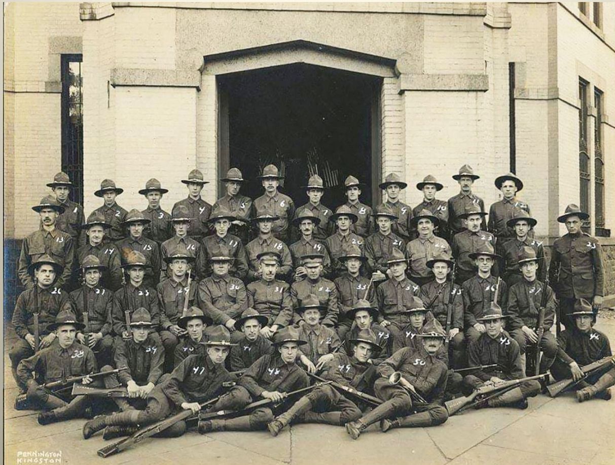
Canadian Ross 1905 MKII*** US Surcharged