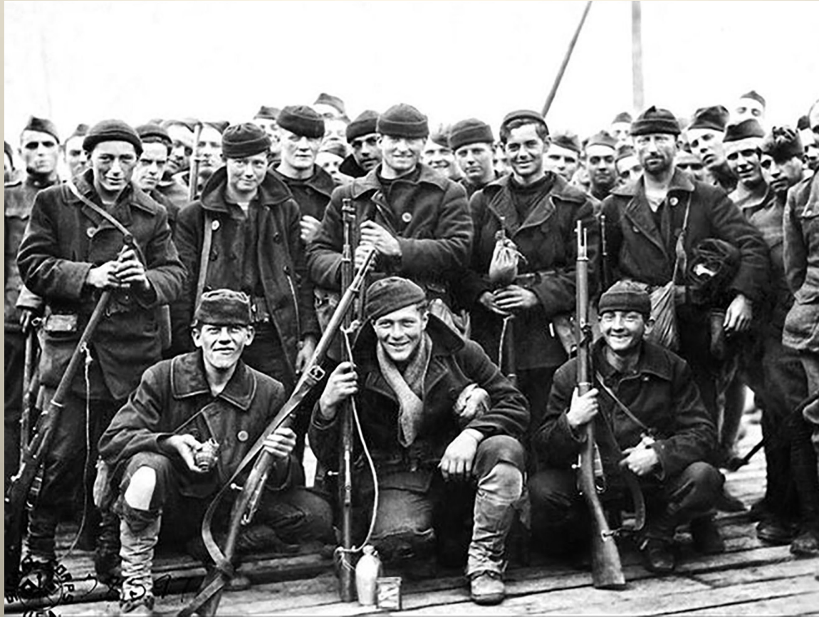
Mosin-Nagant Archangel Campaign - Russia 1918