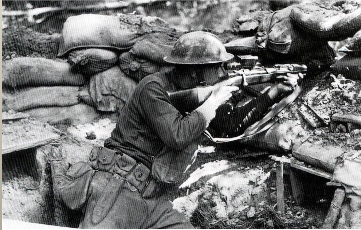
1903 Rifle w/ Warner & Swasey Musket Sight