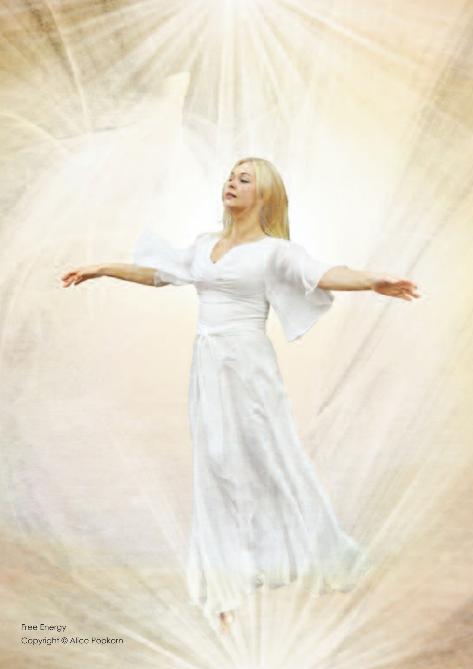
Free Energy