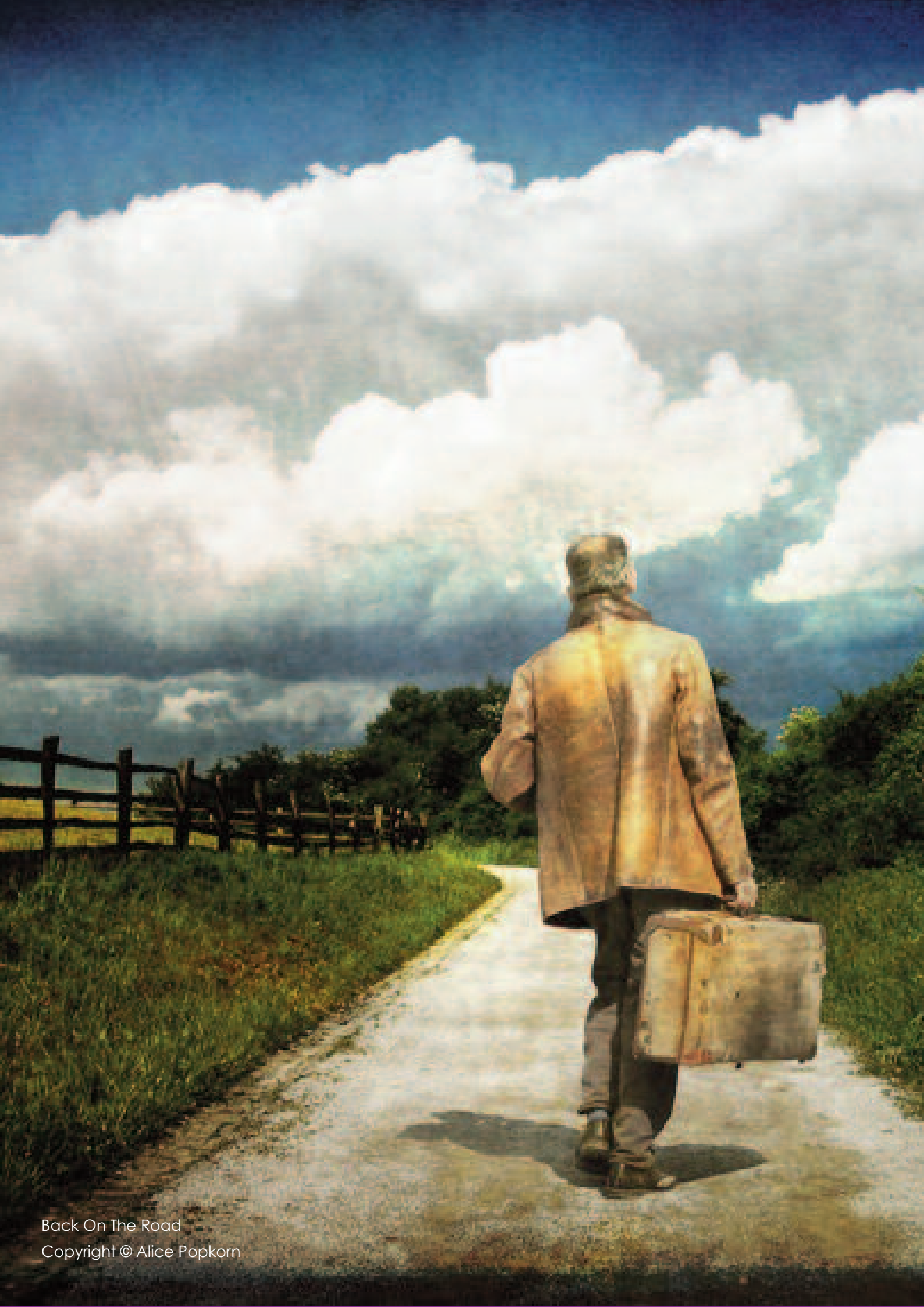
Back On The Road