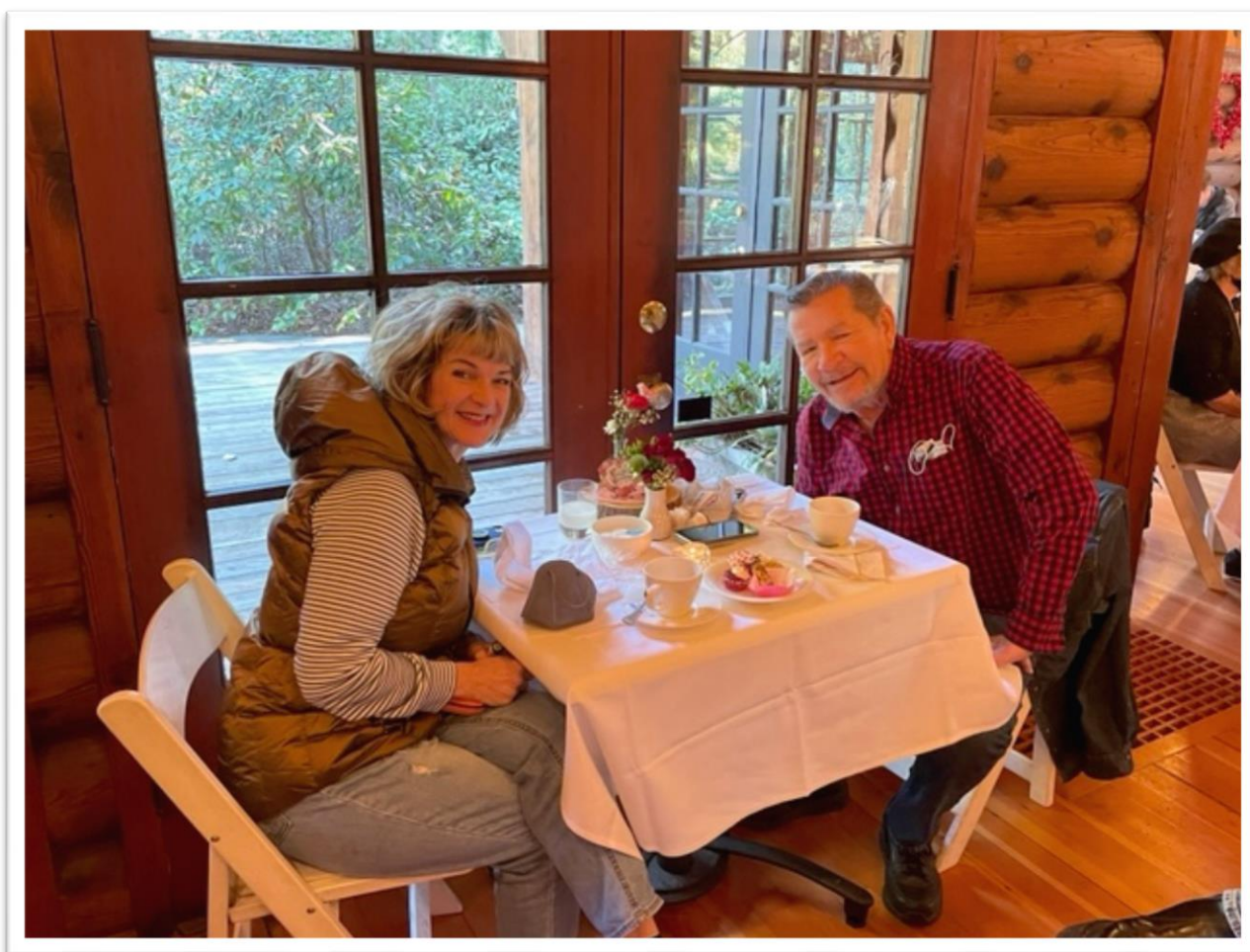
Club members had Brunch for a special Valentine's Celebration at Summit Grove in Ridgefield, WA