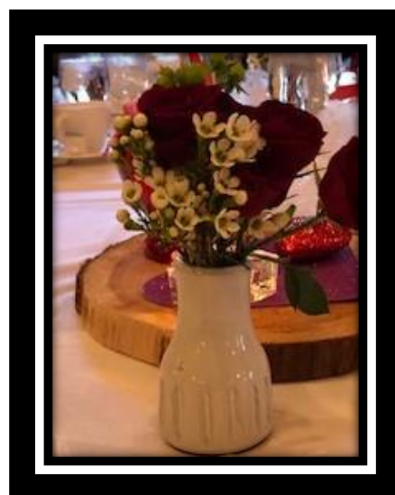
Beautiful Floral Arrangement