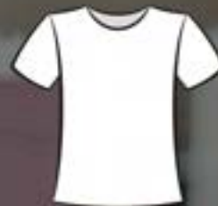
T-SHIRTS 40,500 pcs.