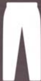
TROUSER 20,250 pcs.