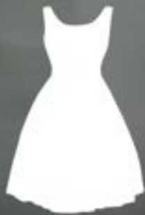
LADIES DREES 21,600 pcs.

P R O D U C T I O N C A P A B I L I T I E S