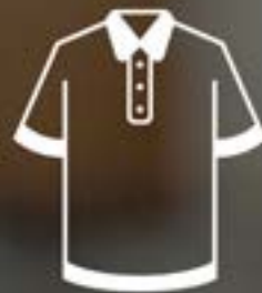
POLO / PICQUE 35,000 pcs.