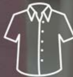
SHIRTS 18,000 pcs.