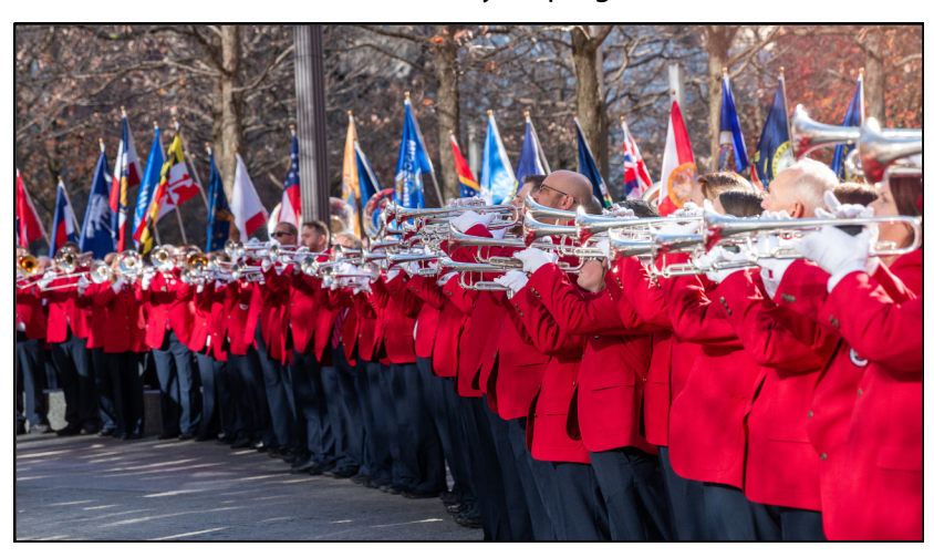
In 2023, The Band Directors Marching Band honored first responders by performing a wreath-laying ceremony at the 9-11 Memorial in New York City.

encouraged to perform local SERVICE THROUGH MUSIC projects with their students in their home communities. Watch for more information as the year progresses.