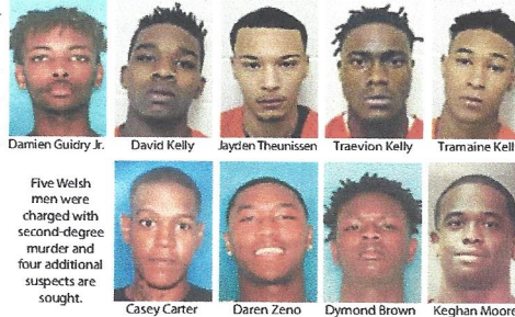
Five Welsh men were charged with second-degree murder and four additional suspects are sought.