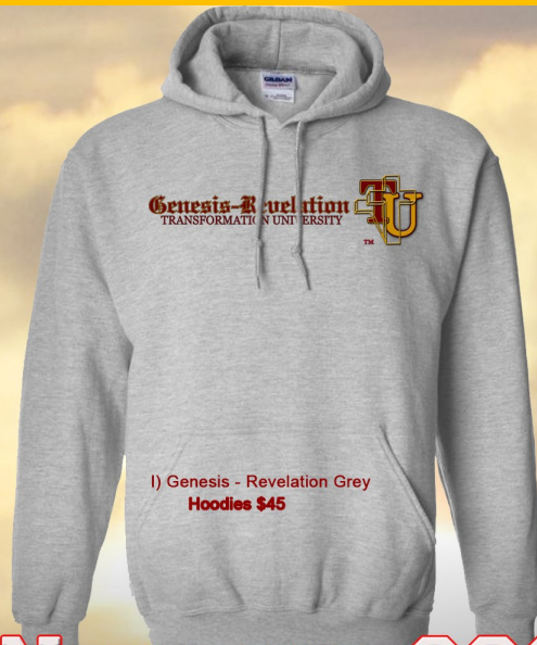
I) Genesis - Revelation Grey Hoodies $45

Genesis—Revelations Helping to transform our Minds!