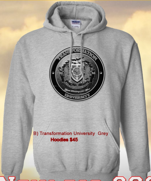
B) Transformation University Grey Hoodies $45