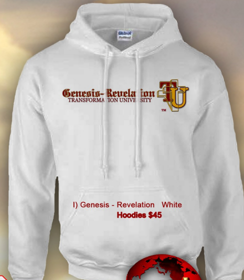
I) Genesis - Revelation White Hoodies $45

NEW FOR 2020 Apparel with a message of Hope & Inspiration!