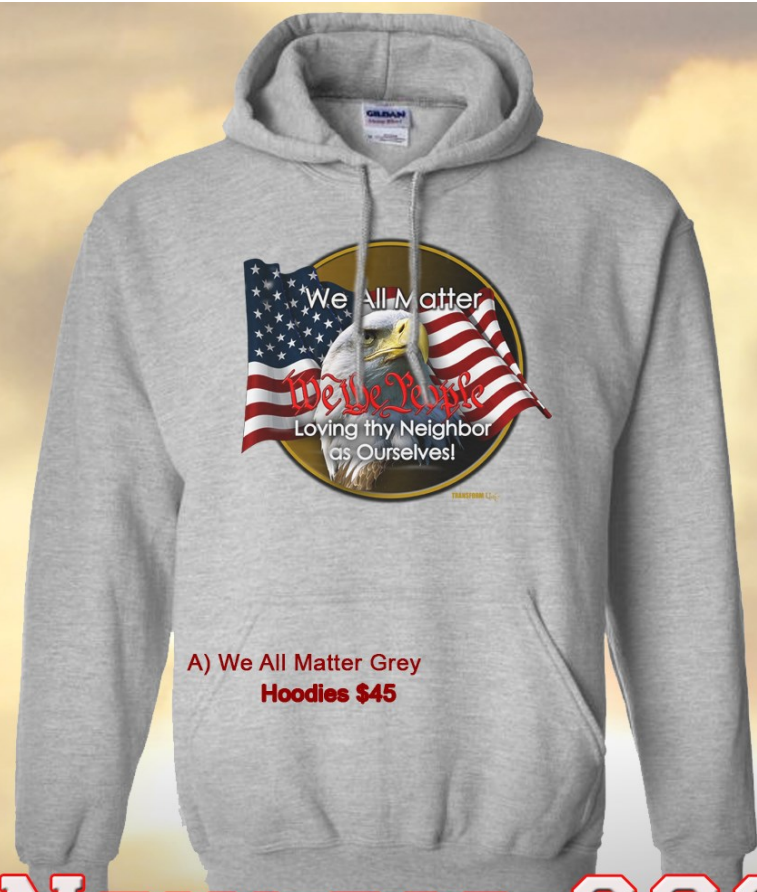
A) We All Matter Grey Hoodies $45

ISAIAH 61:11 – “For as the earth bringeth forth her bud, and as the garden causeth the things that are sown in it to spring forth; so the Lord God will cause righteousness and praise to spring forth before all the nations.