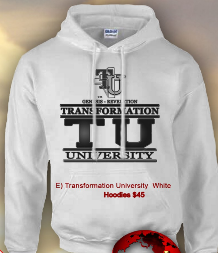
E) Transformation University White Hoodies $45

We invite you to visit our website: thetransformu.com and click on Transform U Wear to see our offerings. For questions or if you would like to speak to someone regarding ordering a garment Call 804-824-9325 or email inform@thetransformu.com and provide your contact information and a representative will contact you back.