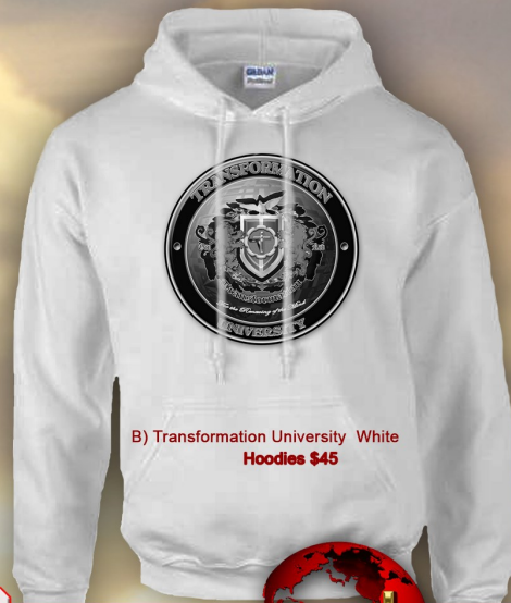
B) Transformation University White Hoodies $45

If you love studying Word of God, learning the principles of God. Than you are a student of Transformation University. This line celebrates being apart of the largest student body in the world!