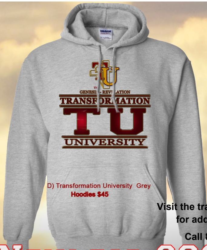
D) Transformation University Grey Hoodies $45

Fortify - To strengthen or invigorate someone physically or mentally.