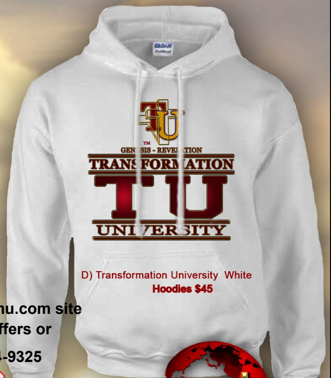
D) Transformation University White Hoodies $45

Visit the transformu.com site for addition offers or