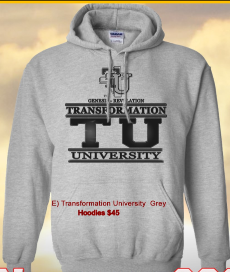
E) Transformation University Grey Hoodies $45