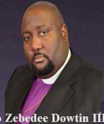
Bishop Zebedee Dowtin III Presiding Prelate