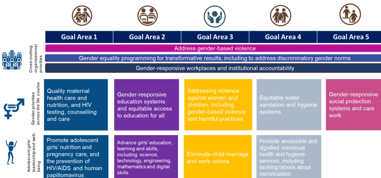
Figure II Gender Action Plan, 2022–2025: programmatic priorities

28. These gender results are mapped in figure II against the Goal Areas and described in greater detail below. All results will be supported by the work of UNICEF in advocacy, innovation, partnerships, data, research and analysis.