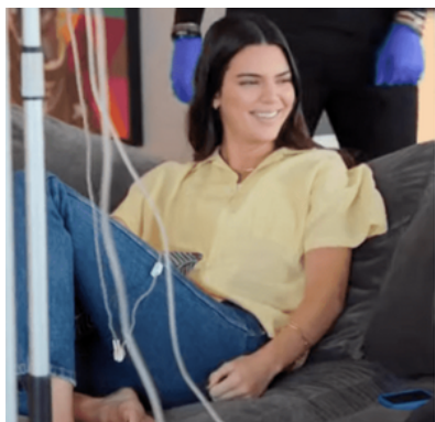
Kendall Jenner and Hailey Bieber receive NAD+. They are not Nüvo You clients.