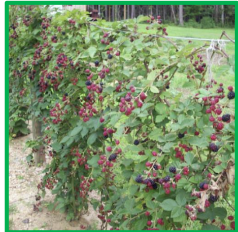
Blackberry Along wall