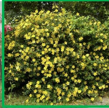
St John's Wart