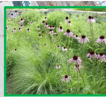
Prairie dropseed grasses with mixed perennial flowers