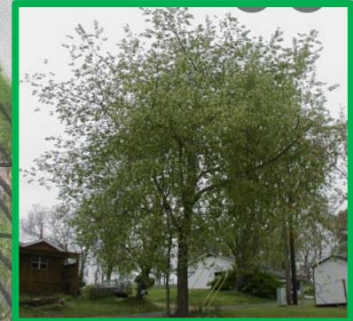
Wild Black Cherry Tree with Gooseberry around it